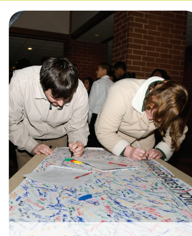
Students sign the banner for Malamulo College after vespers.