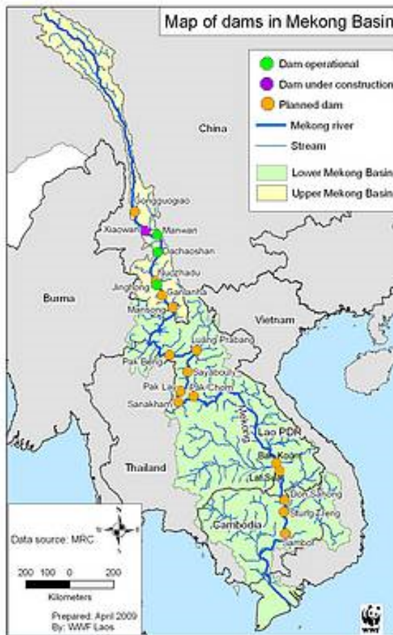
Figure 4: The Mekong River Basin and its associated dams in all stages of operation and planning

( http://www.panda.org/what_we_do/where_we_work/great_mekong/challenges_in_the_greater_mekong/infrastructure_development_in_the_greater_mekong/ )