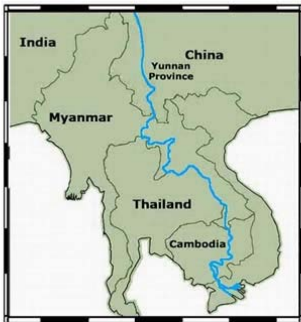
Figure 1: The Mekong River flows through six countries in southeastern Asia ( http://www.taiwandna.com/MalayMekongMigration.jpg )

and spans numerous biomes and land types (Figure 1). Geography's encapsulation of physical and social relationships, and its emphasis on understanding the roles of marginalized groups, enables it to be a strong lens through which to view the social and cultural impacts arising from the construction of transboundary dams.