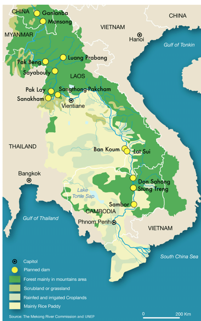
Figure 3: The Mekong River Basin is composed of a diversity of land, vegetation, and soil types.

individuals living along it (Sneddon and Fox 2006, 181-202, Sokhem and Sunada 2008, 219-224). Located in southeastern Asia, the Mekong River Basin is composed of a diversity of land, vegetation, and soil types. The basin contains forested mountains, scrublands, and rice paddy areas, which provide a vast array of resource-based livelihoods (Figure 3). The river and surrounding basin are characterized by annual flooding, which brings nutrients, fisheries, and areas for agricultural production (Sneddon and Fox 2006, 181-202).