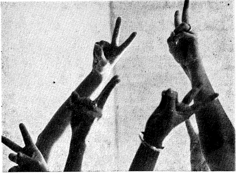
"You youngsters have a big job."