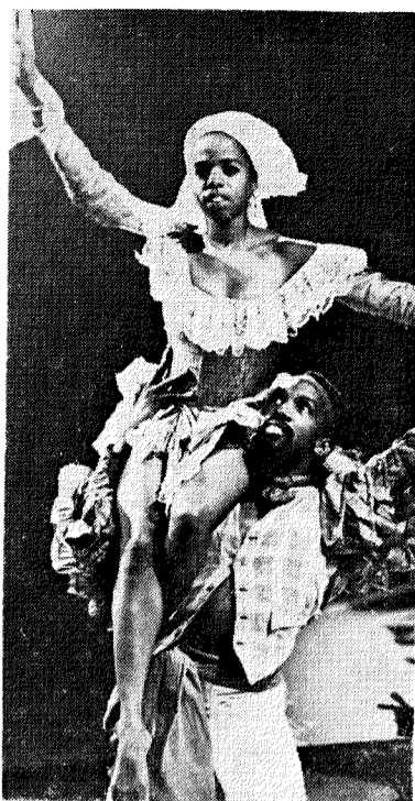
The Citizens for Progress and the Eastern Montgomery County Ministerial Association will present the Arthur Hall Afro-American Dance Ensemble in concert for the benefit of the Citizens for Progress Scholarship Fund, Saturday, October 18, 8:00 p.m. at Abington High School, South Campus Auditorium.