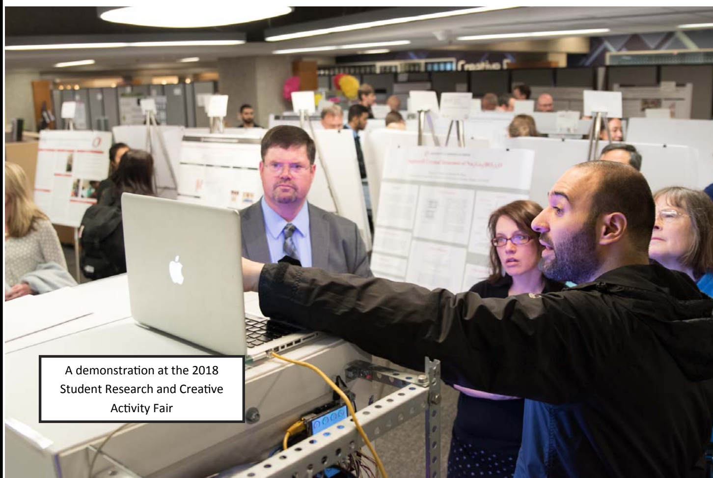
A demonstration at the 2018 Student Research and Creative Activity Fair