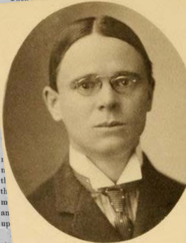
ROScoe POUND, 1870.

... must drink. "I'll come," he said, and added in a voice that was wild and boisterous, "When there's whiskey round you kin allers count Peachy in."