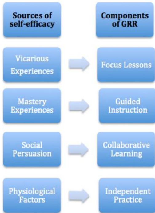
Figure A. The four primary sources of self-efficacy aligned to the four components of the Gradual Release of Responsibility method of scaffolding.