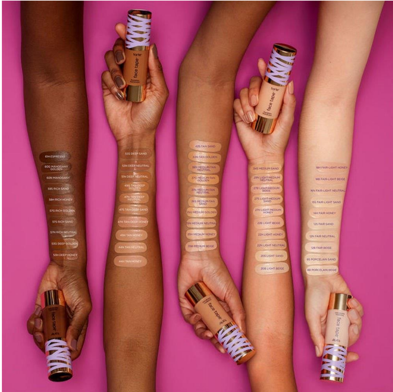
Figure 5. Shade range of Tarte's Face Tape foundation.