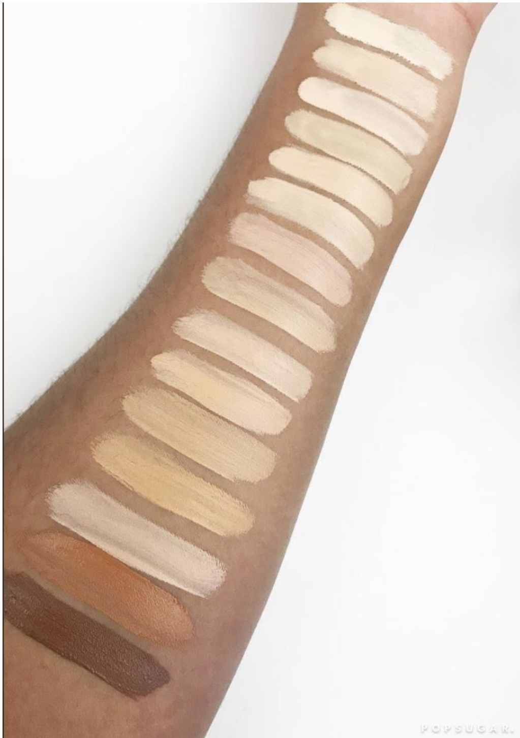
Figure 3. A photograph displaying each shade of Tarte's Shape Tape foundation applied on the arm of a Popsugar employee.