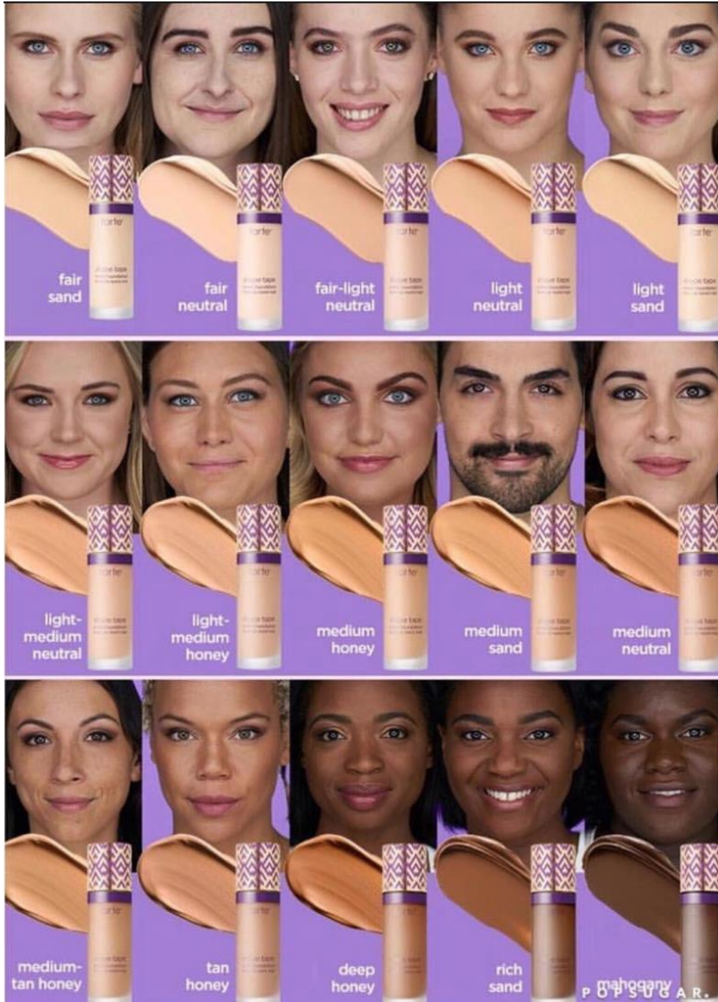
Figure 2. Tarte Shape Tape foundation shade range.