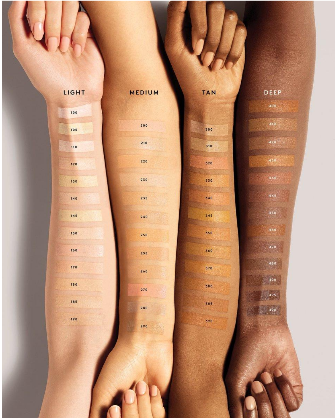
Figure 4. Fenty Beauty Pro Filt'R foundation shade range.