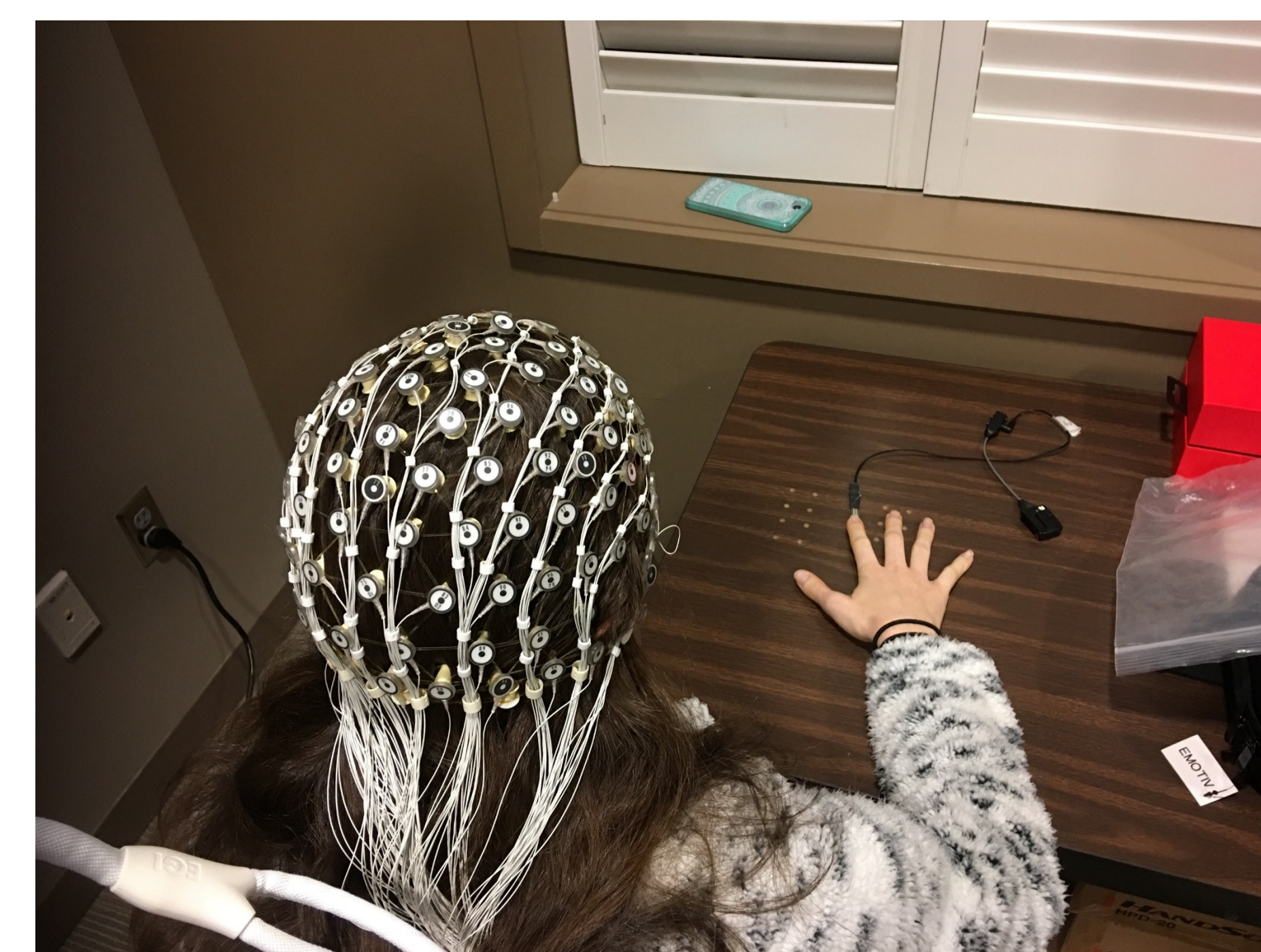
Figure 1: Participant equipped with a 128-channel electroencephalogram (EEG), and tapping on a force sensor.