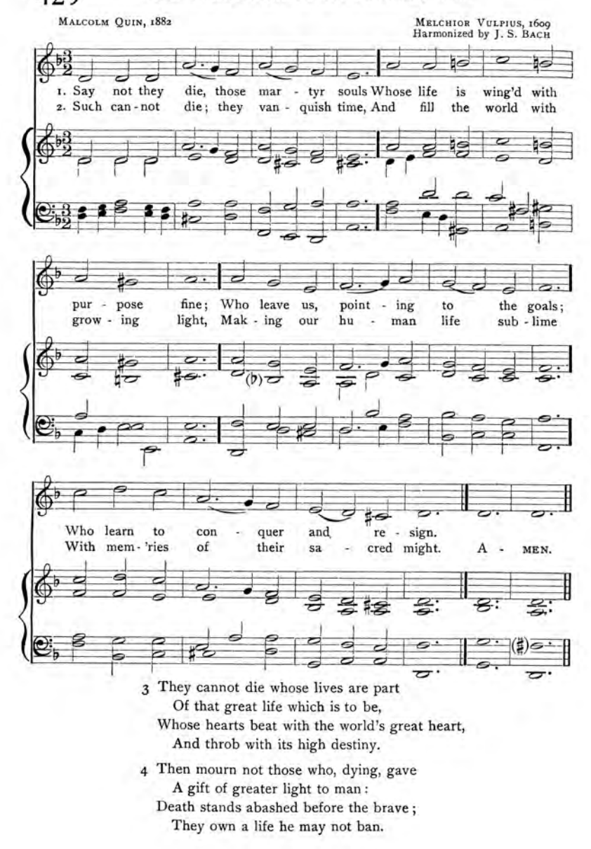
Example 3: A preexisting hymn with new texts set by Quin. Source: Hymns of the Spirit with Services (Boston: Beacon Press, 1937).

In his Memoirs , Quin writes about his experience as a hymn writer: