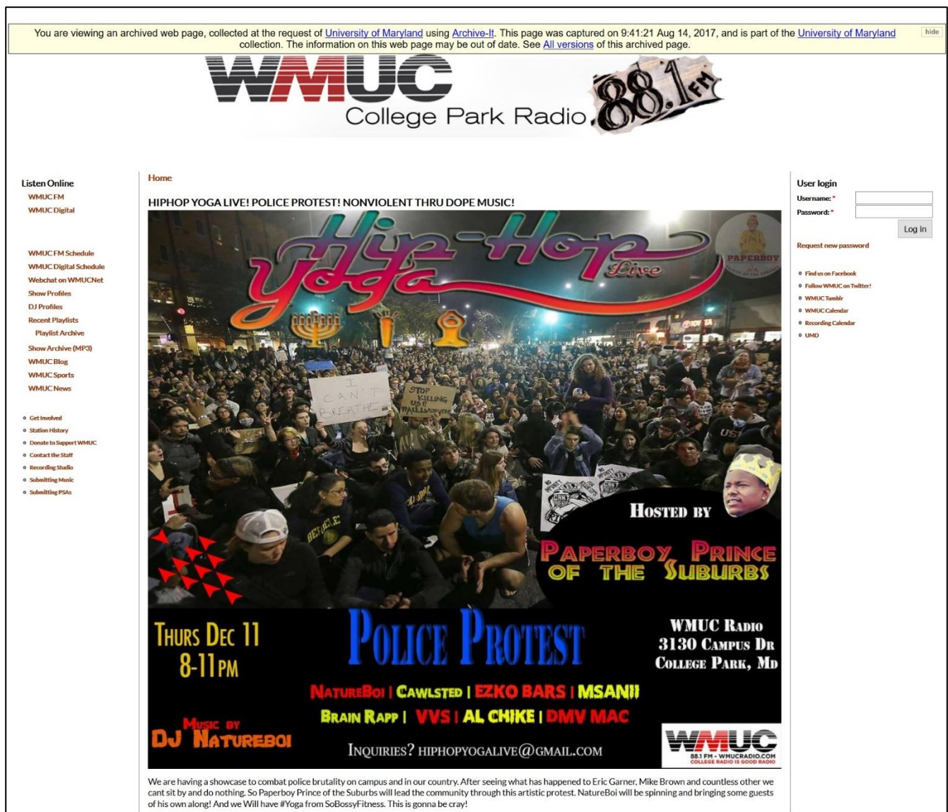
Figure 3. Archived website of WMUC, a student-run radio station at UMD, December 10, 2014. 54