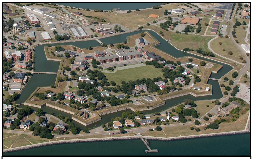
Figure 4. Aerial photograph of Fort Monroe, Virginia. Photograph by the National Park Service, 2015.

The United States National Park Service and the Fort Monroe Authority of the Commonwealth of Virginia jointly manage Fort Monroe. The fort is now open to the public, the history is interpreted at the Casemate Museum, and new exhibits in the Fort Monroe Visitor and Education Center will be unveiled later this year. It is hoped that improved access and understanding of archival records will inspire visitors to reflect on what freedom meant in 1619, 1861, and what freedom means today. When completed, this research project has the potential to reveal thousands of names previously lost to history, enabling us to humanize and commemorate the countless individuals associated with the Fort Monroe Arc of Freedom.