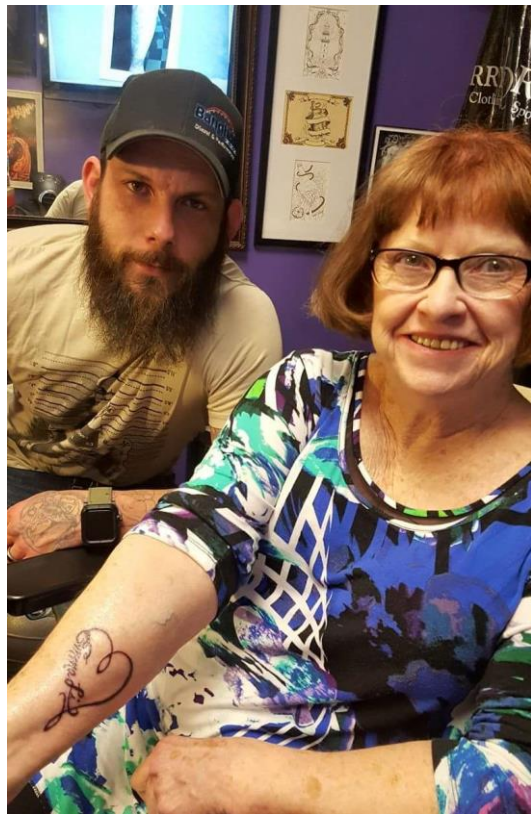
Mom's first tattoo in 2017 (73 years old here)