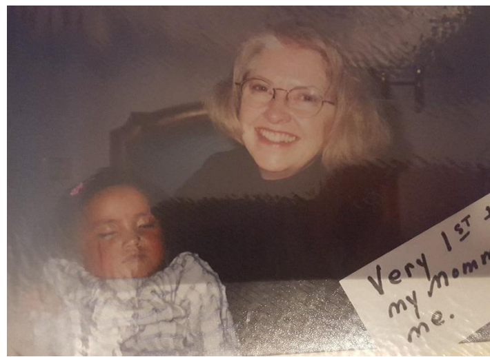
My mom and me at the hotel where we met (November 1999)