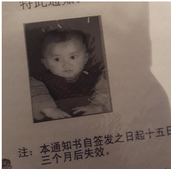
The only picture China sent my mom of me before the adoption (probably 1 year old)