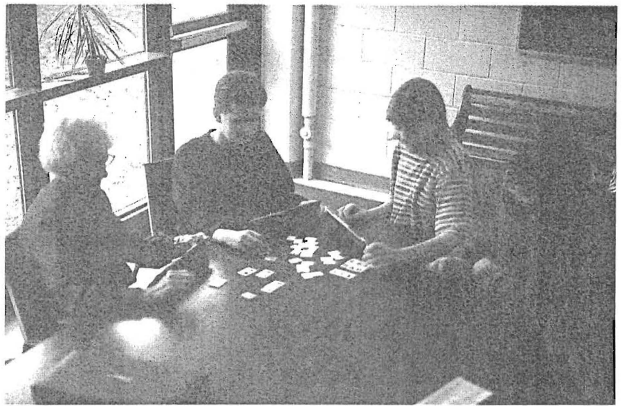
Students benefit from community service by increasing their self-esteem, self-knowledge, and communication and social skills.

Community Sites. We contacted a local retirement center and K-6 teachers in an adjacent elementary