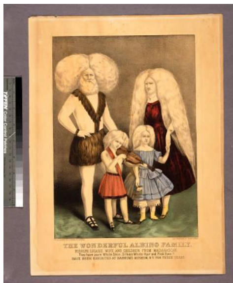
Figure 5. The Wonderful Albino Family .

The Jay T. Last Collection of Entertainment: Circus Prints and Ephemera is held by the Huntington Library and contains 650 items related to circus material. It also shares a number of similar subject headings to the Becker Collection. Unlike that collection, though, the subject headings used by the Last Collection deploy a different approach. Rather than use terminology such as “freak show,” the collection uses subject headings such as “Entertainment events—Pictorial works” and “curiosities and wonders—pictorial works.”