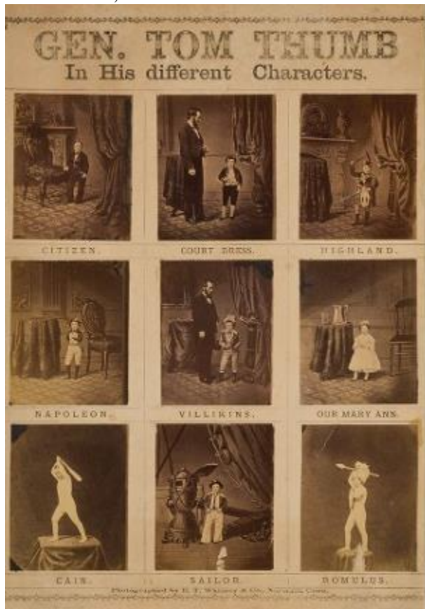
Figure 9. General Tom Thumb in His Different Characters, ca. 1850s.

Stratton married fellow performer M. Lavinia Warren in 1863 and the two had a happy marriage. Stratton's performances brought him renown as a celebrity, perhaps one of the biggest at the time, and he and Warren were able to live comfortably when not working. On 15 July 1883, Stratton suffered a stroke and passed away. He is buried at Mountain Grove Cemetery in Bridgeport, Connecticut, with his wife beside him.