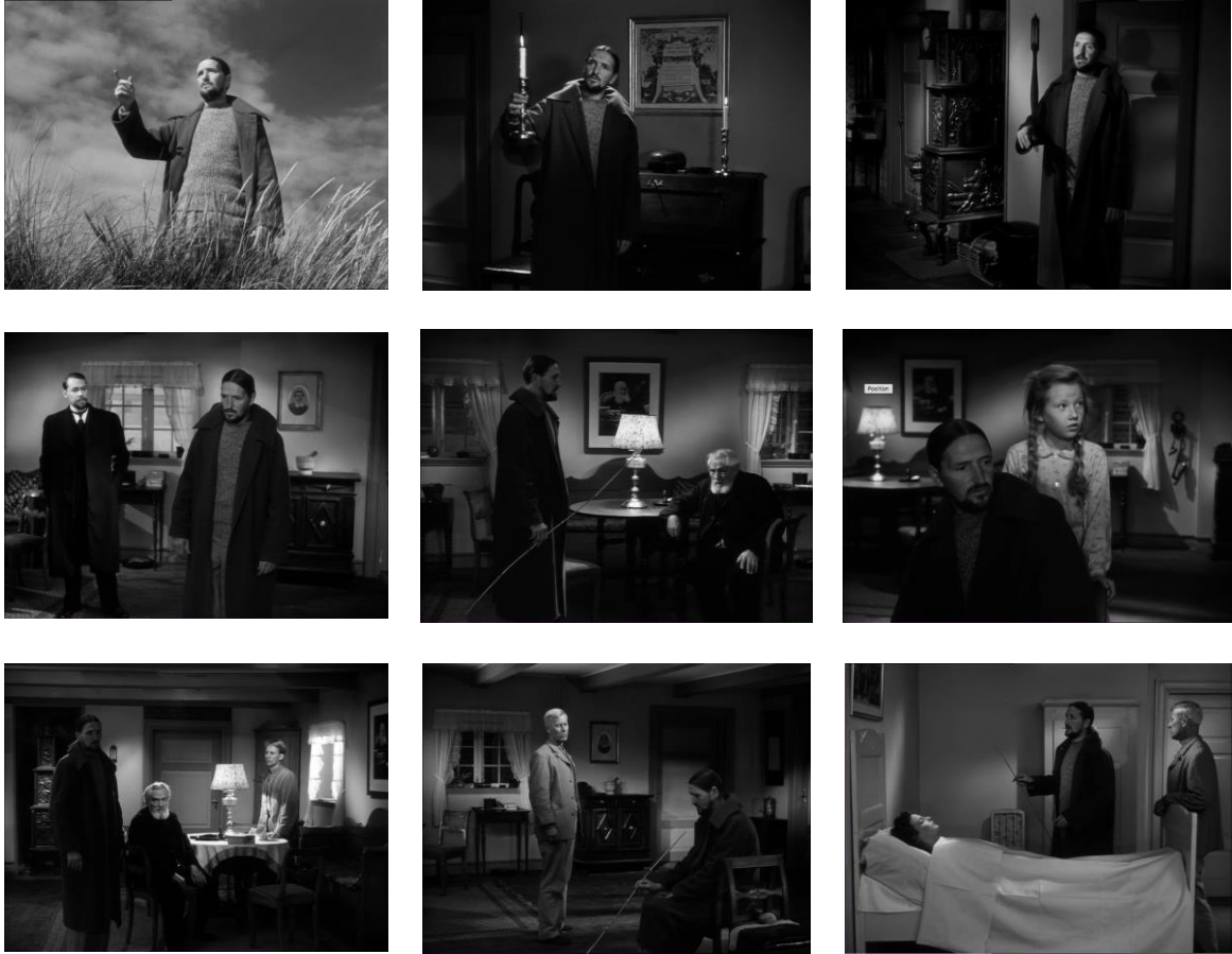
Figure 2 Johannes is dimly lit in all except the first of Johannes's nine scenes prior to the finale, a strategy that is especially pronounced when contrasted with how others are lit.