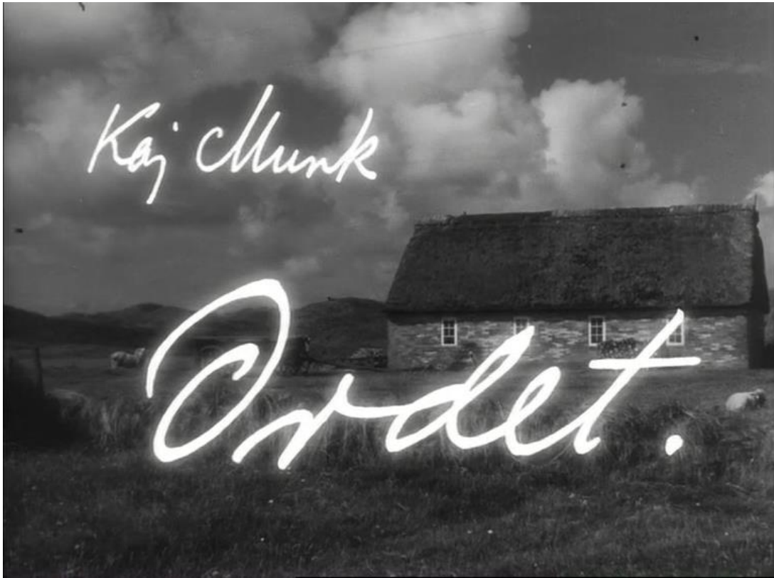
Figure 4 Kaj Munk is given a possessory credit, the only credit of the entire film.

misguided, an act of wrongheaded loyalty. Blame for Jesus's death is thus laid at the feet of the occupying forces, the Romans. Indeed, an early draft was titled The Story of the Jew Jesus ,