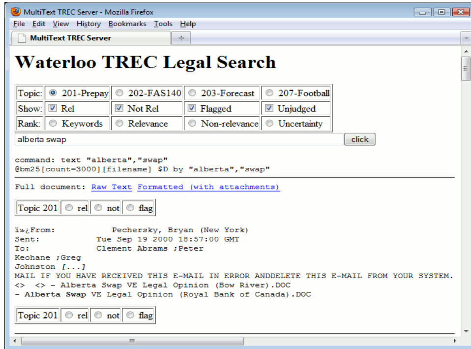
Figure 1: Waterloo's interactive search and judging interface. 161

[42] The third and final phase estimated the density of relevant documents as a function of the score assigned by the active learning system, based on the assessments rendered during the active learning phase. 162 Waterloo used this estimate to gauge the tradeoff between recall and precision, and to determine the number of documents to produce so as to optimize F_1 , as required by the task guidelines. 163