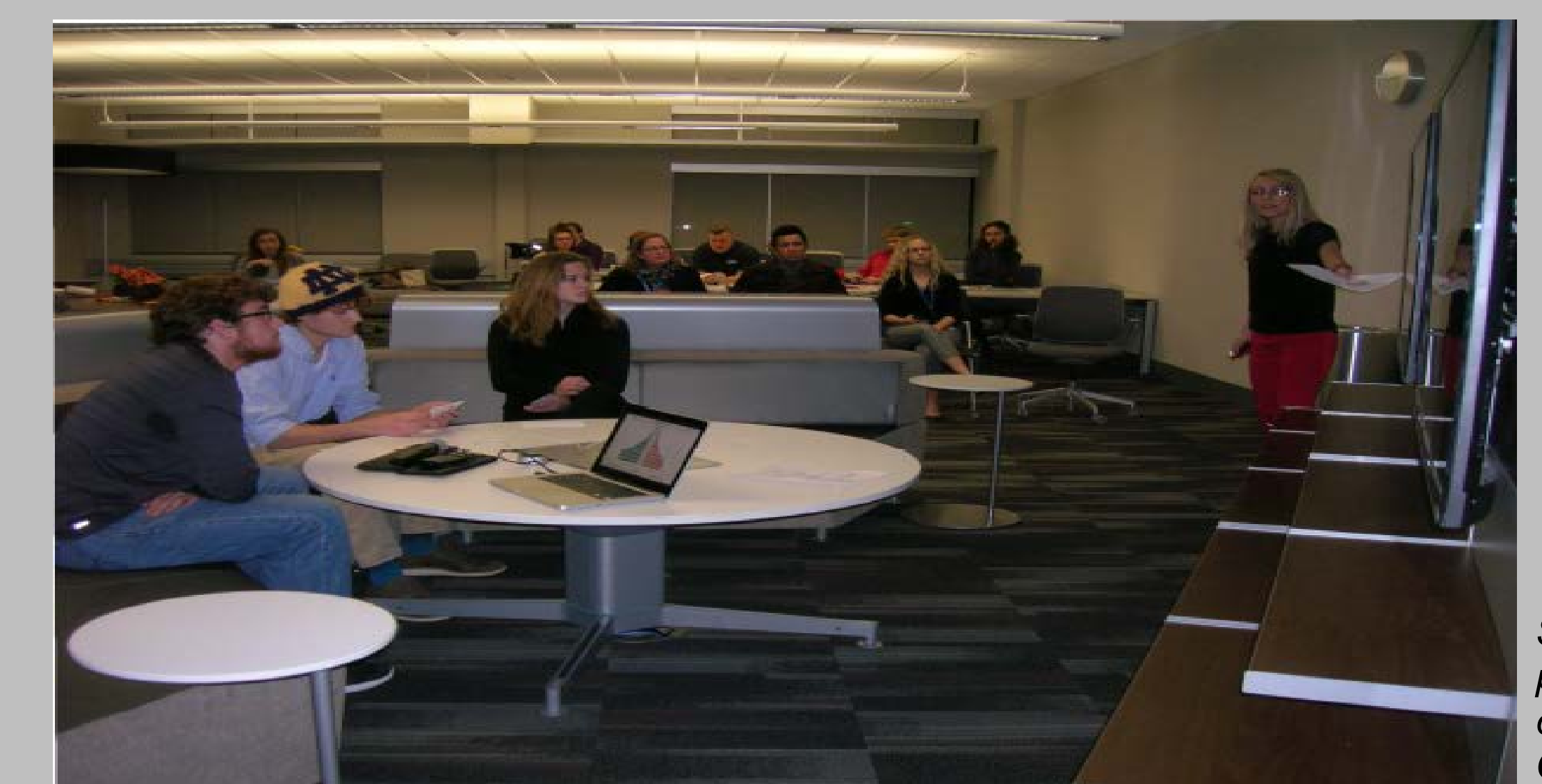
Student presentations during the Celebration Party

We consider ourselves particularly fortunate to have this assignment turned opportunity. Not only did we get to hear the Pashto language spoken by a native speaker, we were also exposed to three other languages (Karin, Nepali and Sudanese Arabic). The opportunity to hear elders speaking in their native tongues was appreciated by the entire cohort and the elders were happy to share their language with us.