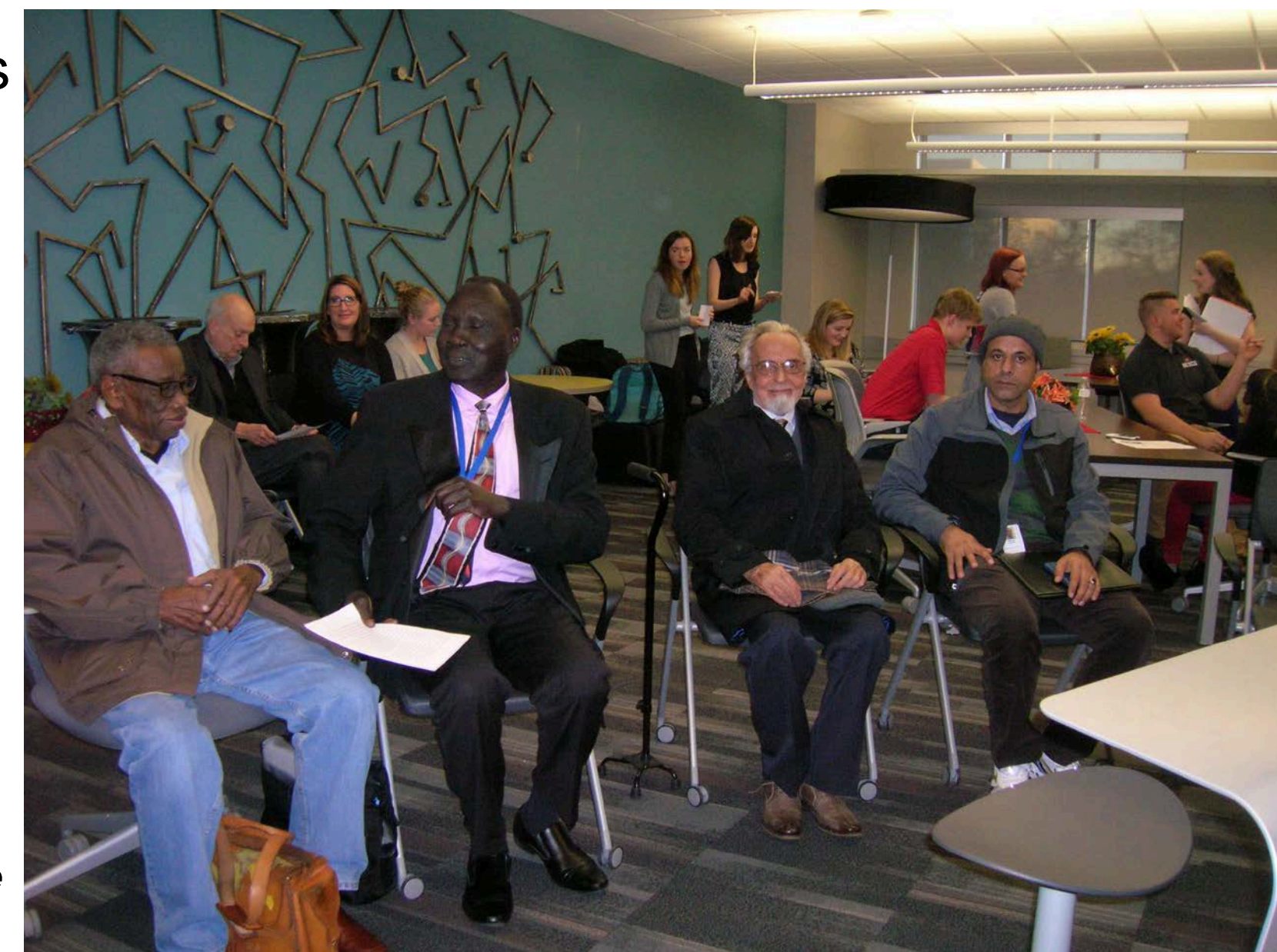
Esteemed elders at the Celebration Party

Our cohort was made up of sixteen University of Nebraska Omaha students that received the Honors Learning Community scholarship. We met together four days a week and studied Gerontology, Geography, and English Composition II in a linked class system. This allowed us to study the differences in elder care around the world due to cultural differences while writing proficient academic papers for all three classes. The skills and perspectives gained in these classes culminated in our Coming to America Project, wherein we recorded the story of a refugee elder who migrated to the United States.