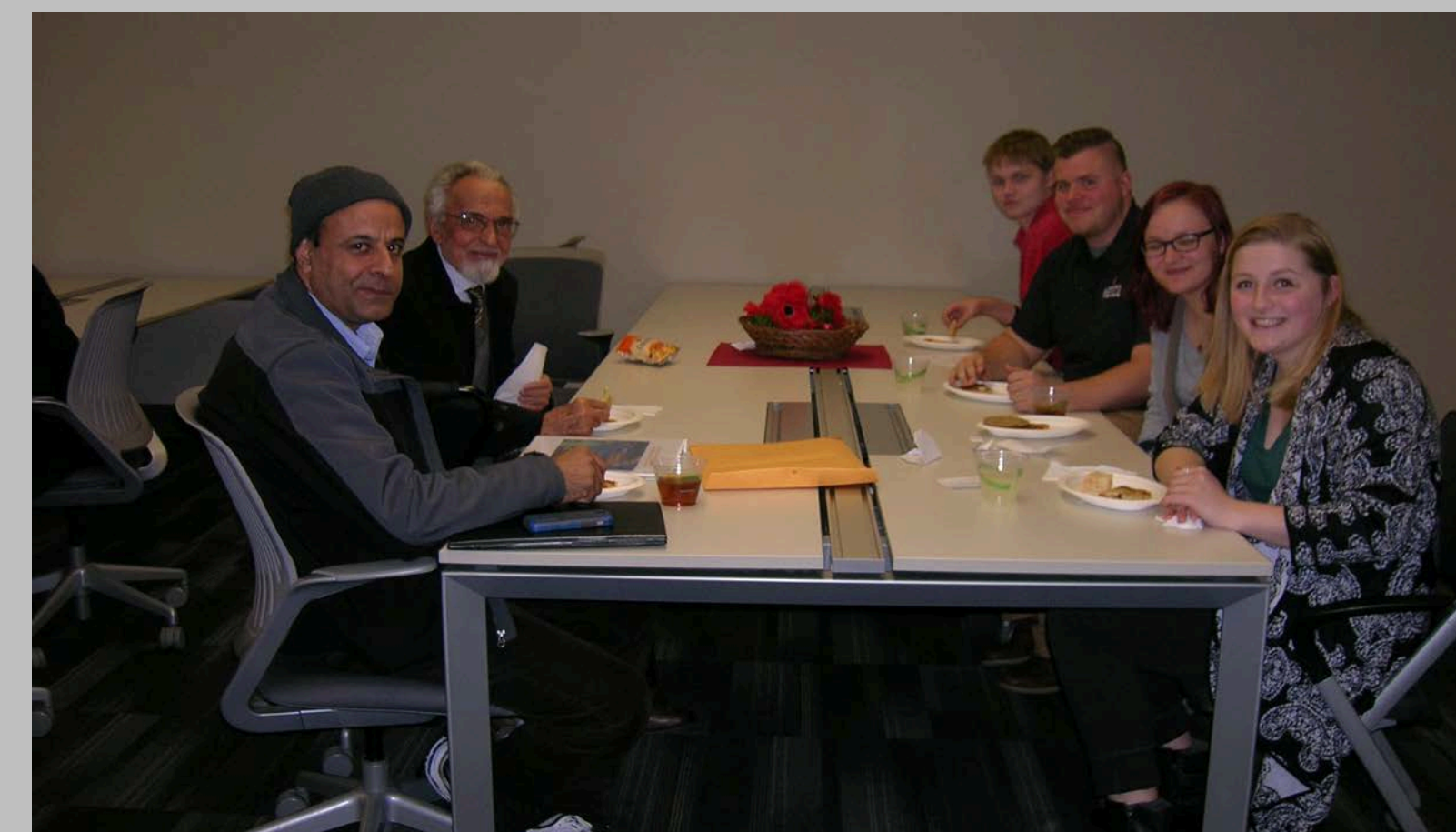
Team Southwest Asia with our elder and translator

The Coming to America project concluded with our group constructing our elder's memories into a cohesive paper, which was possible because of the alignment between our courses and because we spent the semester perfecting our writing.