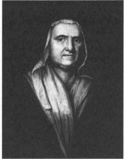
Left: Figure 1. SAMUEL PRINCE (1649–1728) by an unknown artist, possibly Peter Pelham. Grisaille on panel, 13 x 14 in.