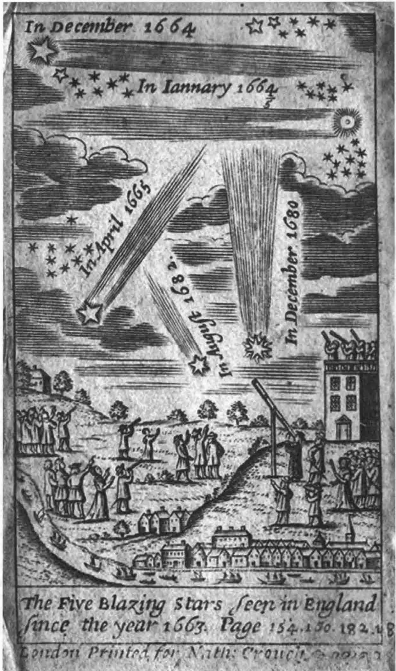
Figure 3. Frontispiece of Nathaniel Crouch [R. B., pseud.], Surprizing Miracles of Nature and Art , 2d ed. (London, 1685).