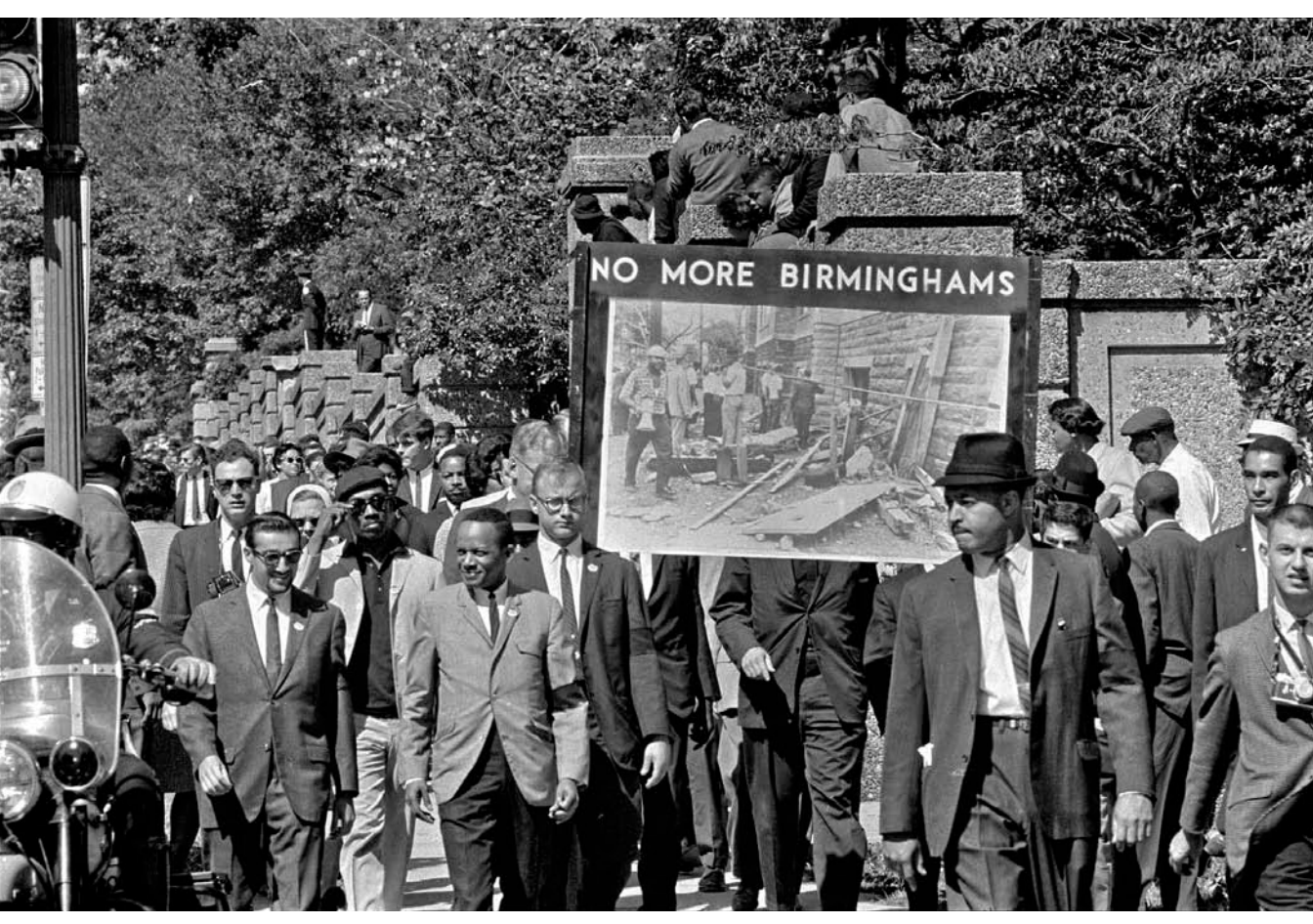
The Association of Black Women Historians posted a response to The Help on Amazon.com, which praised the performances of the African American actresses in the film, but drew attention to shortcomings in both the novel and the film, including the absence of "the reign of terror" perpetuated by the Ku Klux Klan and the White Citizens Council, but also of the black activists who responded. The Congress of Racial Equality (CORE) marching in memory of black youngsters killed in Birmingham bombings, Washington, D.C., September 22, 1963, by Thomas J. O'Halloran, U.S. News & World Report Magazine Photograph Collection, Library of Congress.

mind all the sufferings black people faced. How young white women were judged by their status . . . This book, while completely enthralling me, taught me a lesson in life and moving on." Another response from a reader in Boston emphasized the power of the novel's message, "This book will change you and give you much to think about. After you read it, share it with another. This book is meant to be discussed over and over. It has a very important theme and message." Such responses, which support Travis's thesis about why white readers respond favorably to popular novels of personal transformation, seem important, even if they do not always lead the reader to activism.