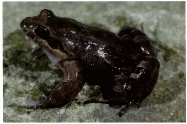
FIGURE 1. Leptodactylus silvanimbus, USNM 509803, male, 43.3 mm SVL, Belén Gualcho, Honduras.