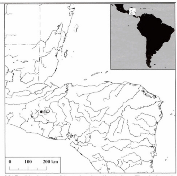
MAP. Distribution of Leptodactylus silvanimbus . The circle marks the type locality and another nearby site; the dot indicates the other locality known for the species.

The advertisement call consists of a single note per call, given at a rate of 17–27/min (Heyer et al. 1996) or 40–64/min (Wilson et al. 1986). Call duration ranges from 0.15–0.17 s. The call has about 160 partial pulses/s. The frequency of the call is weakly modulated, first rising and then falling, the modulation not discernible to the human ear. The intensity of the call is weakly modulated, reaching its loudest intensity by the first quarter to third of the call and maintaining the intensity for much of the remainder. The dominant frequency is the fundamental