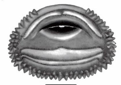
FIGURE 3. Oral disk of Leptodactylus silvanimbus (after McCranie et al. 1986). Bar = 1 mm.