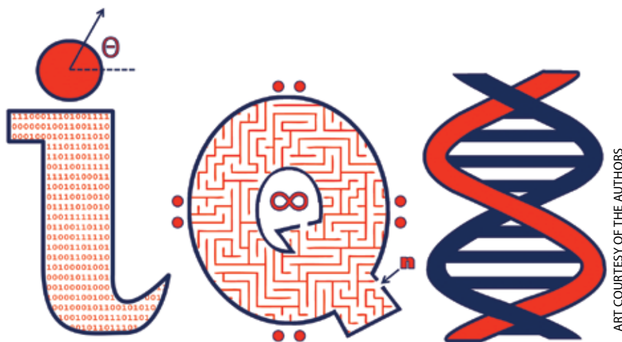
Design for the interdisciplinary course, Integrated Quantitative Science , showing elements from chemistry, biology, computer science, physics, and math.

To help undergraduates make connections among disciplines so they are able to approach, evaluate, and contribute to the solutions of important global problems, our campus has been focused on interdisciplinary research and education opportunities across the science, technology, engineering, and mathematics (STEM) disciplines. This paper describes the mobilization, planning, and implementation of a first-year interdisciplinary course for STEM majors that integrates key concepts found in traditional first-semester biology, chemistry, computer science, mathematics, and physics courses. This team-taught course, Integrated Quantitative Science (IQS) , is half of a first-year student's schedule in both semesters and is composed of a double lecture and a weekly lab and workshop. Features of this first-year course, including themes and concepts covered each semester, some of the materials developed, lessons learned, challenges, and preliminary measures of success are described.