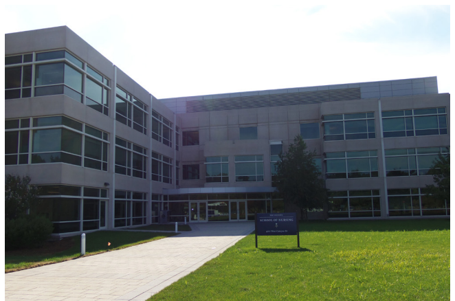
400 West Campus Drive