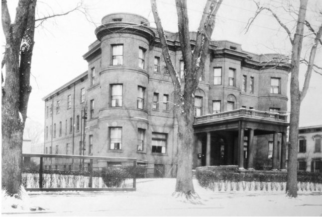
Nathan Smith Hall