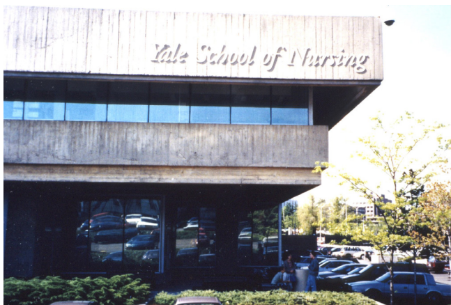
100 Church Street South