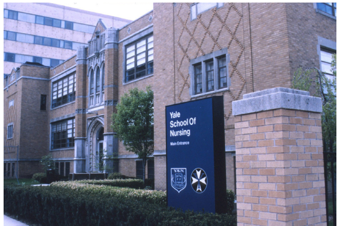
855 Howard Avenue