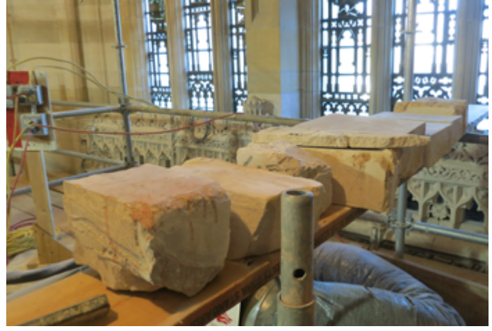
Examples of some of the deteriorated stones from the walls of the nave; after damaged stones were removed, they were replaced with carefully crafted replicas.