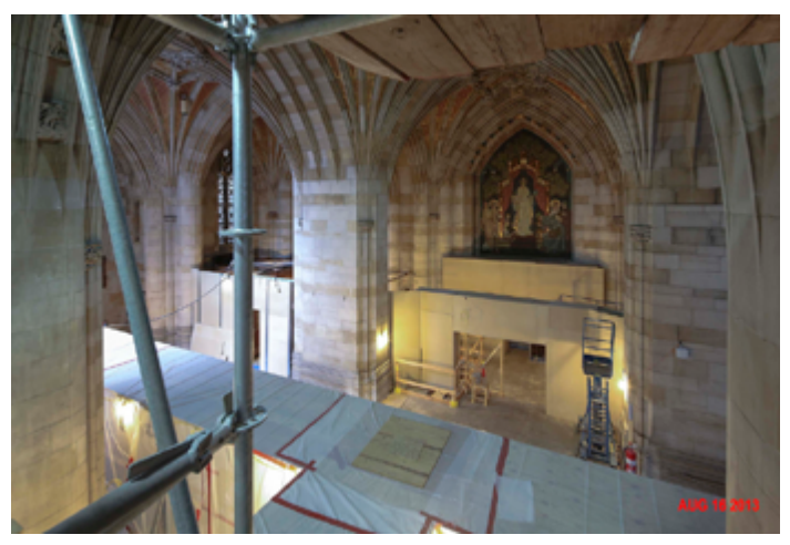
The mural of Alma Mater, viewed from the interior scaffolding in the nave. Restoration of the mural is taking place throughout the spring.