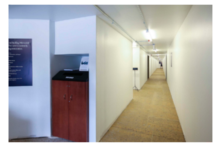
The specially constructed pedestrian tunnel, viewed from inside the High Street entrance. The tunnel allowed construction activities to occur throughout the nave, while still allowing users access to the reading rooms and collections in SML.