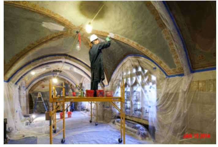
An art restorer cleans and repairs the decorative painted border of the plaster ceiling in the north aisle.