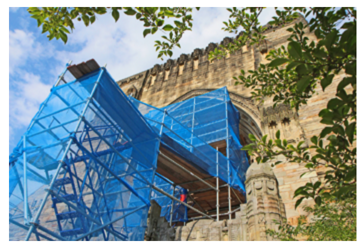
Exterior scaffolding at SML's High Street entrance enabled workers to clean the stones surrounding the monumental stained glass windows.

Two major parts of the project will continue during the spring: the restoration of the prominent Alma Mater mural above the circulation desk, and the cleaning and repair of the decorative woodwork that fills the nave at floor-level. A newly constructed service desk for the north aisle of the nave and a reconfigured security and welcome desk at the High Street entrance are being built to complement the original woodwork nearby. Although work in the side aisles will continue throughout the summer, the pedestrian tunnel is anticipated to come down in June, which will reveal the restored nave for the first time. All parts of the nave will reopen to users in August, just in time for the beginning of the new semester, and opening celebrations are being planned for the fall. The SML nave is being restored thanks to a generous gift from Richard Gilder '54 and his wife, Lois Chiles. -KC