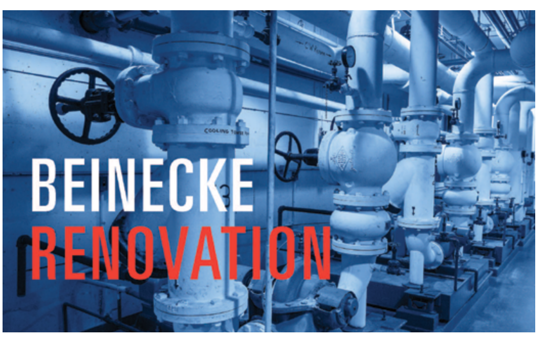
The Beinecke Library will close for a major renovation following commencement ceremonies in May 2015, reopening in August 2016.

Visit the renovation website for more details: http://beineckelibraryrenovation.yale.edu -MC