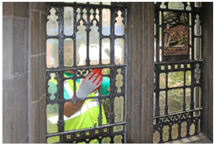
A worker in the Selin Courtyard removes a portion of the stained glass windows in the north aisle, so that the glass and lead elements can be restored.

Far left, opp. page : A detail of the painted plaster ceiling high above the nave. Before cleaning, the vibrant colors and intricate designs were barely visible.