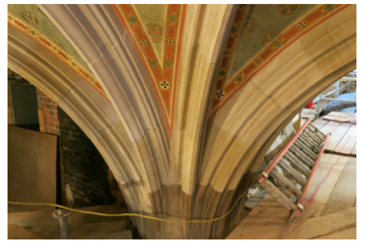
Detail of a stone arch at the nave ceiling; stone that has been cleaned forms a stark contrast with stone that has not.