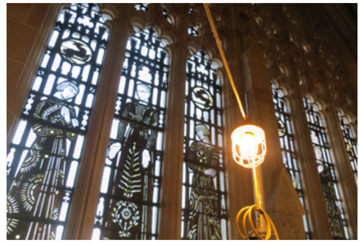
The figures of Honesty, Imagination, Courage, Tolerance, Wisdom, and Wit, as they appear in the stained glass windows above the High Street entrance into the library.