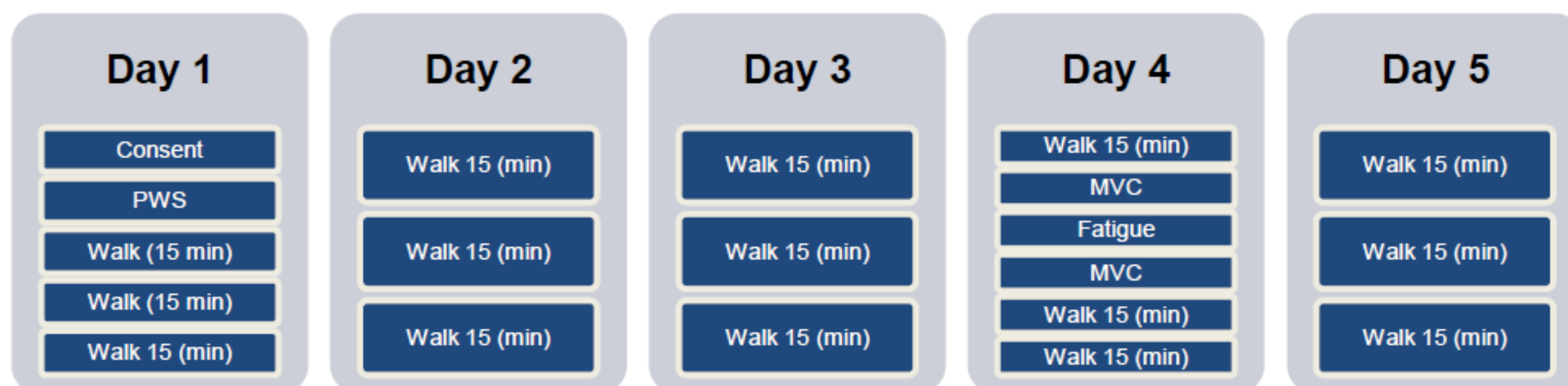
Figure 1. 5-day Protocol