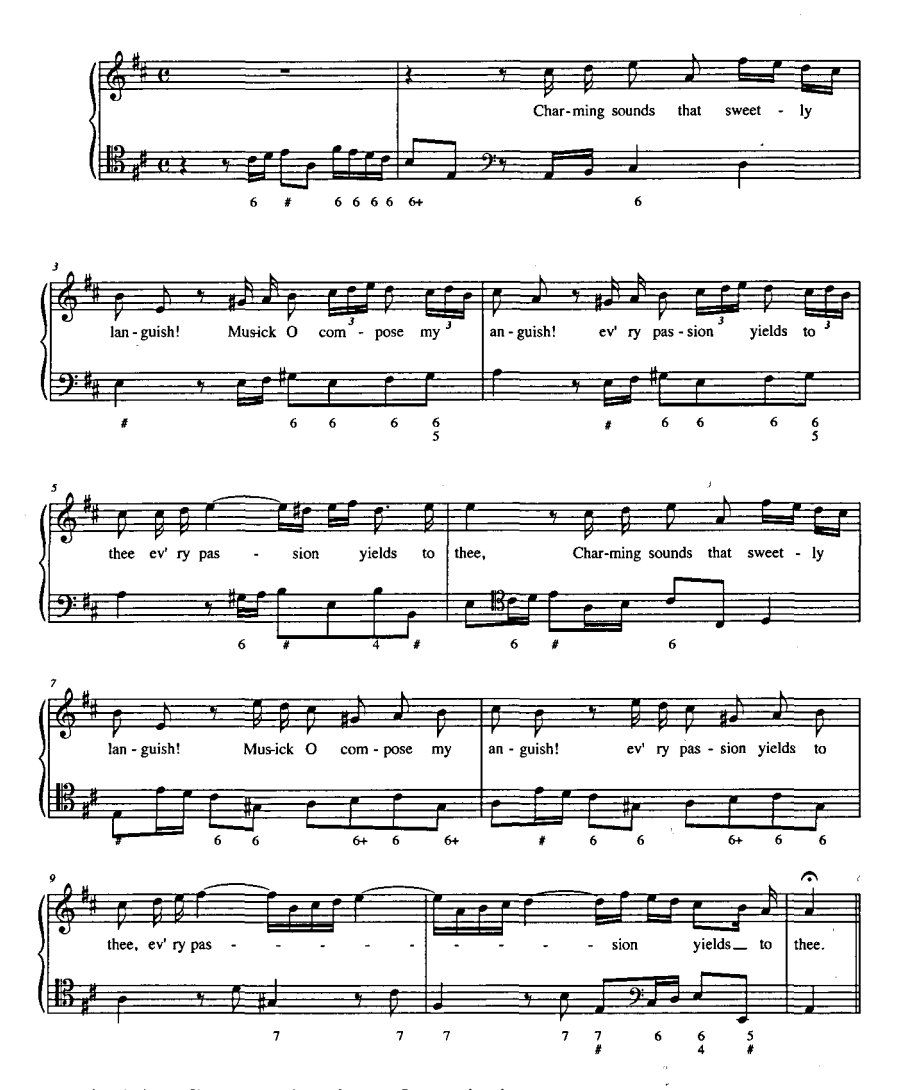
Example 4.4 J.C. Pepusch, Alexis, first aria, bars 1-11

In the very brief introduction to the first aria, Pepusch reveals the opening vocal melody which is presented immediately following the two-bar prelude (see Musical Example 4.4). A triplet figure then appears as the defining rhythmic element for the second part of the opening phrase. Also apparent in Example 4.4 is the continual exchange of motivic figures between the voice and continuo lines.