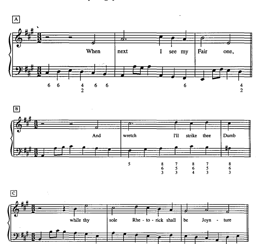
Example 4.3 J. Eccles, The Rich Rivall, first aria themes A, B, and C

crosses the bar line, with the note of longer duration arriving on the downbeat of the new bar. The aria opens happily enough, until the swain's abrupt shift of affection from one young woman to another. Eccles again resists beginning the aria with a direct quotation of the opening vocal melody; yet he includes a sixteenth note figure in the prelude, which is the defining musical element of the second half of the vocal phrase in this instance, as throughout the aria, the voice and continuo exchange melodic and rhythmic motives between the two lines. The semi-cantata is standard with regard to harmonic conventions: the recitative begins in the key of A major and ends in the dominant (E major) preparing us for the return of A major for the following aria. The B section is in the relative minor, a harmonic movement used often by other early English cantata composers, Pepusch in particular. The A section is significantly longer than the B section-in fact, nearly three times longer. Word painting is used sparingly throughout: at times suggesting something quite contrary to the expected meaning. For example, in the A section, a fioriture sequence of dotted rhythms sets the word 'tender' where the preceding melody line was quite smooth, leaving the impression that the use of a dotted rhythm in the setting of 'tender' is anything but. Additional