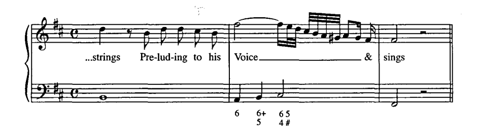
Example 4.5 J.C. Pepusch, Alexis, second recitative, bars 9-11

When Apollo appears in the second recitative, moved by the pleas of Alexis, Pepusch sets'the final bars of the recitative as a grand cadential figure, a clear example of Apollo's musical abilities, and the rapidly descending line on the word 'voice' prepares us for the following aria sung by Apollo (see Musical Example 4.5).