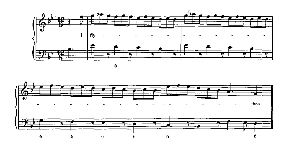
Example 4.1 D. Purcell, Love I defy thee, bars 15-18

In considering the continuo line, motivic sequence plays an important structural role in each aria. Octave leaps also function as defining elements in the bass line for both arias, as can be seen in Musical Example 4.2 below.