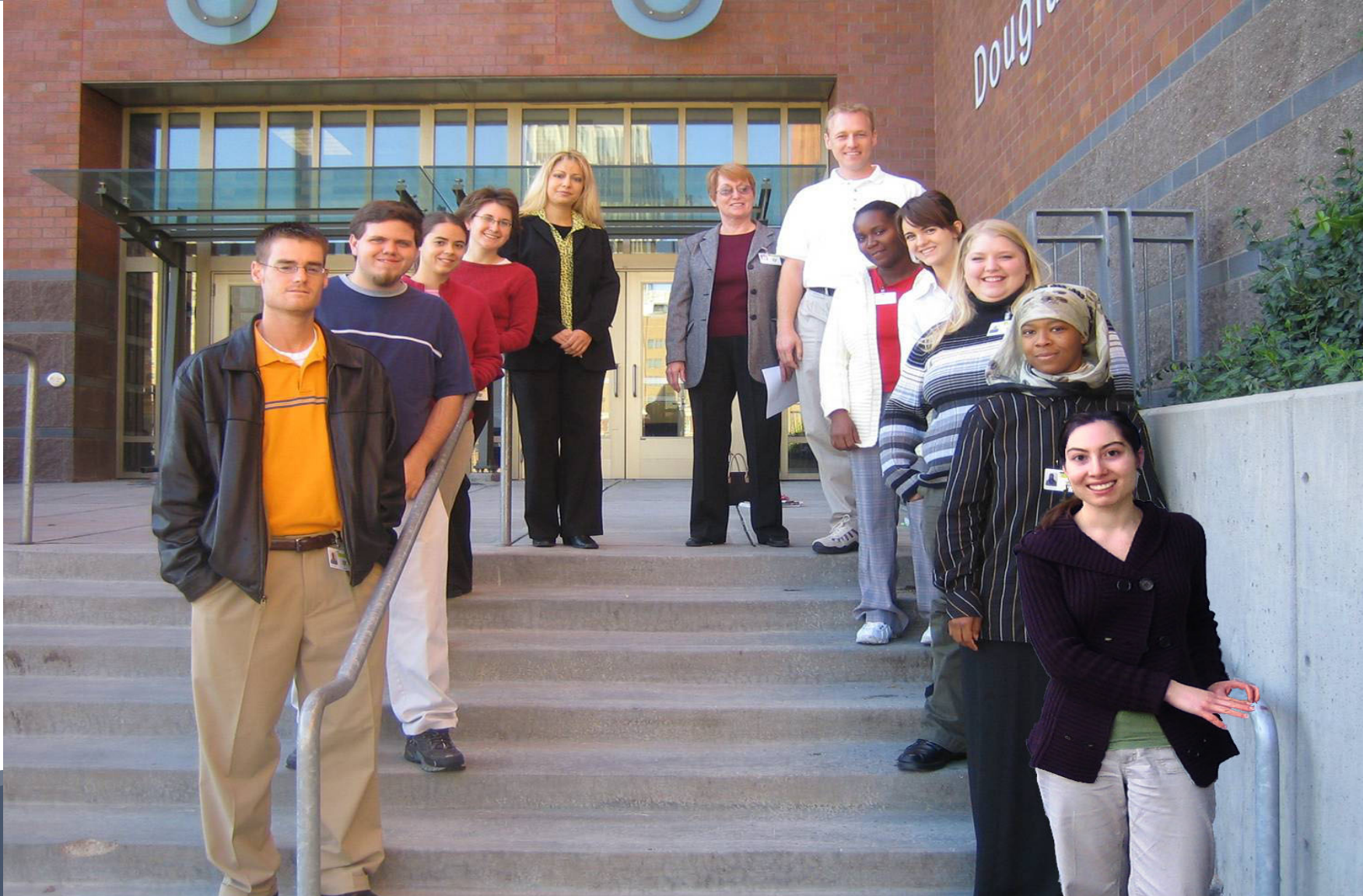
Diversity Among Student Tutors