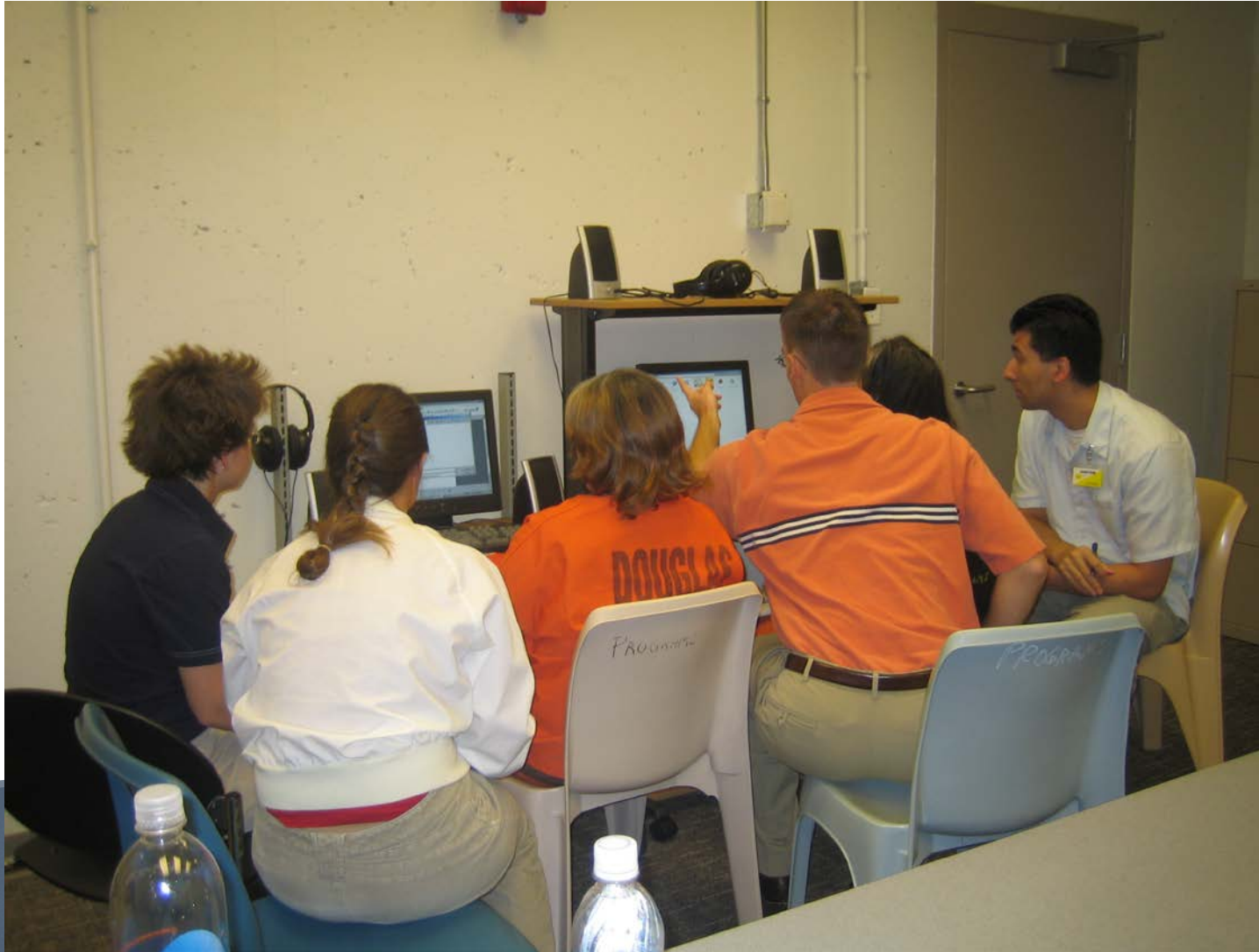
In the class room at the Jail