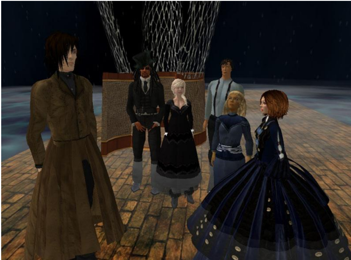
Figure 2. Usher Cast and Students Gather in the Fog

Technologists and educators partnering on such projects should heed the following tips. Indeed, the most difficult part of the collaboration on Usher was not the building process but planning for effective use of the built 3D space.