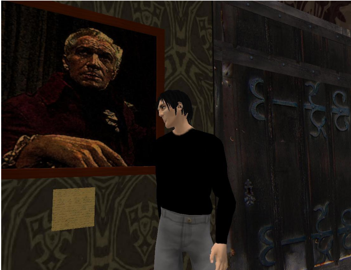
Figure 6. Roderick Usher in OpenSim, as the House of Usher Rises Again

Moreover, the ill-timed decision by Linden Lab to end educational discounts for renting server space has pushed many educators to consider moving part or all of their teaching and research to OpenSim grids. The Usher simulation described returned to the designers' inventories when the university sponsoring the project closed its virtual island.