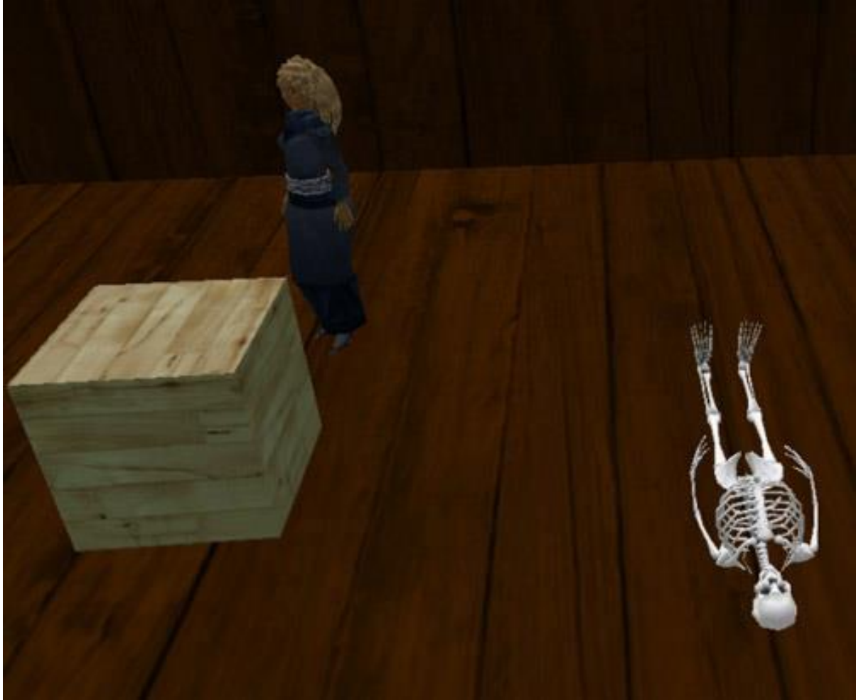
Figure 5. A Student's Avatar Finds Something Unexpected in the Attic

The designers could not have been happier when a student gave this feedback: "Not only did I feel engaged, but I felt as if I had a role in this story. I was no longer a passive reader, but an active actor within the story." 13