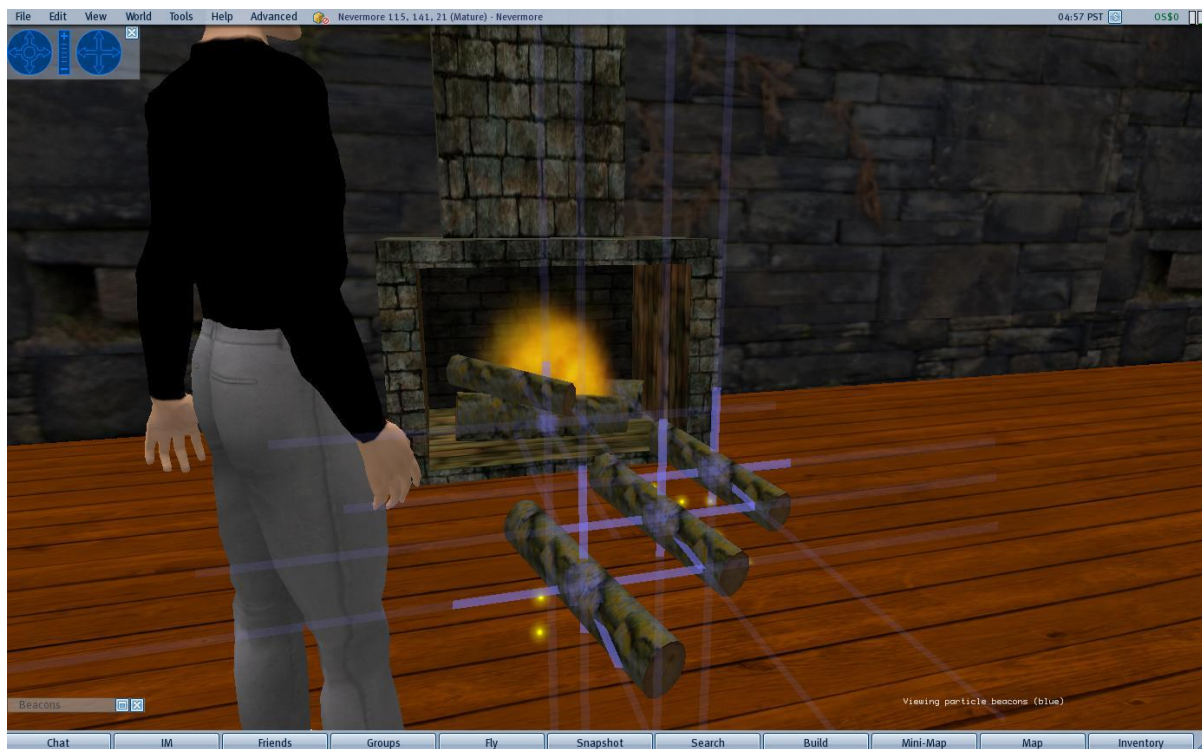
Figure 7. A New Fireplace in OpenSim, with Some Builder's Tools Shown

Creators of commercial virtual worlds are charged with maintaining the broader platform and providing incentives for customers to return; however, designers of smaller simulations for a class need not concern themselves with issues of "churn," or the rate at which users leave a virtual world. 14 Churn and lack of uptake seem to have doomed Arden, an ambitious virtual world based on the works of William Shakespeare and headed by noted telecommunications scholar Edward Castronova. 15 Our technology needs and overhead (see Figure 7), however, have been far less demanding than Castronova's.