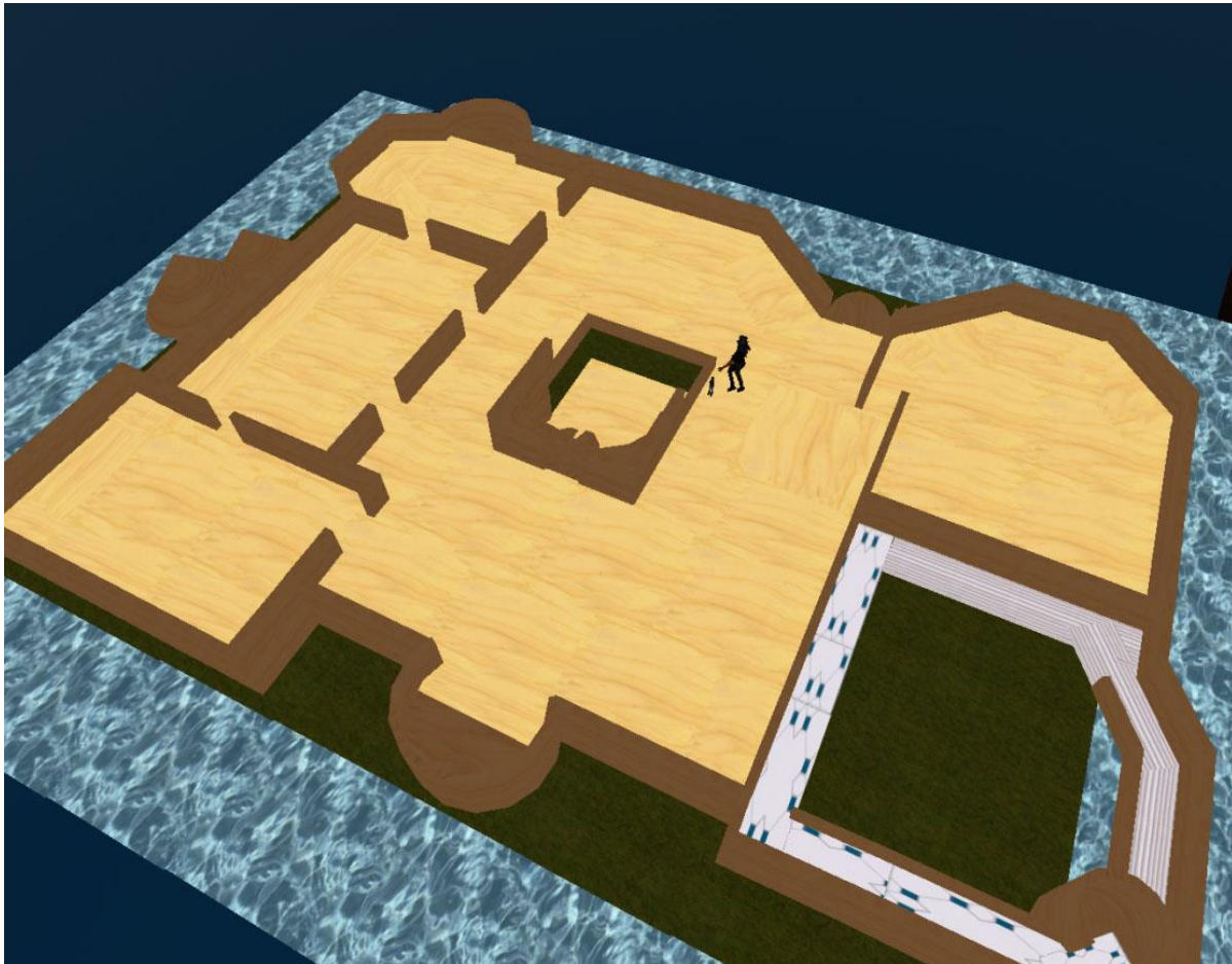
Figure 1. Floor Plan Just After Import from SketchUp

The University of Richmond team, comprising two faculty advisors and builders, a building-and-design consultant, and a student builder, spent over 200 hours during the course of a summer constructing the House of Usher . (Figure 1 shows the floor plan created in SketchUp .) Another three months were devoted to furnishing the house; choosing, developing, and testing interactive objects; and selecting period costumes for the students to choose from.