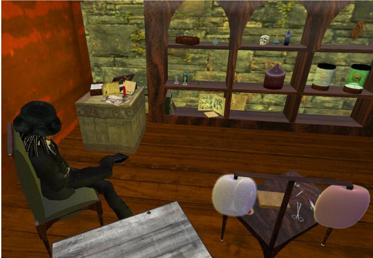
Figure 3. Doctor's Examining Room, with Props Made and Purchased

Faculty-student teams may rightly balk at hiring out builds. Learning to build establishes a local skill set for other projects if university participants assist. That said, it really helps to have a skilled primary builder do most of the heavy lifting and, at every stage, have a design consultant provide advice.