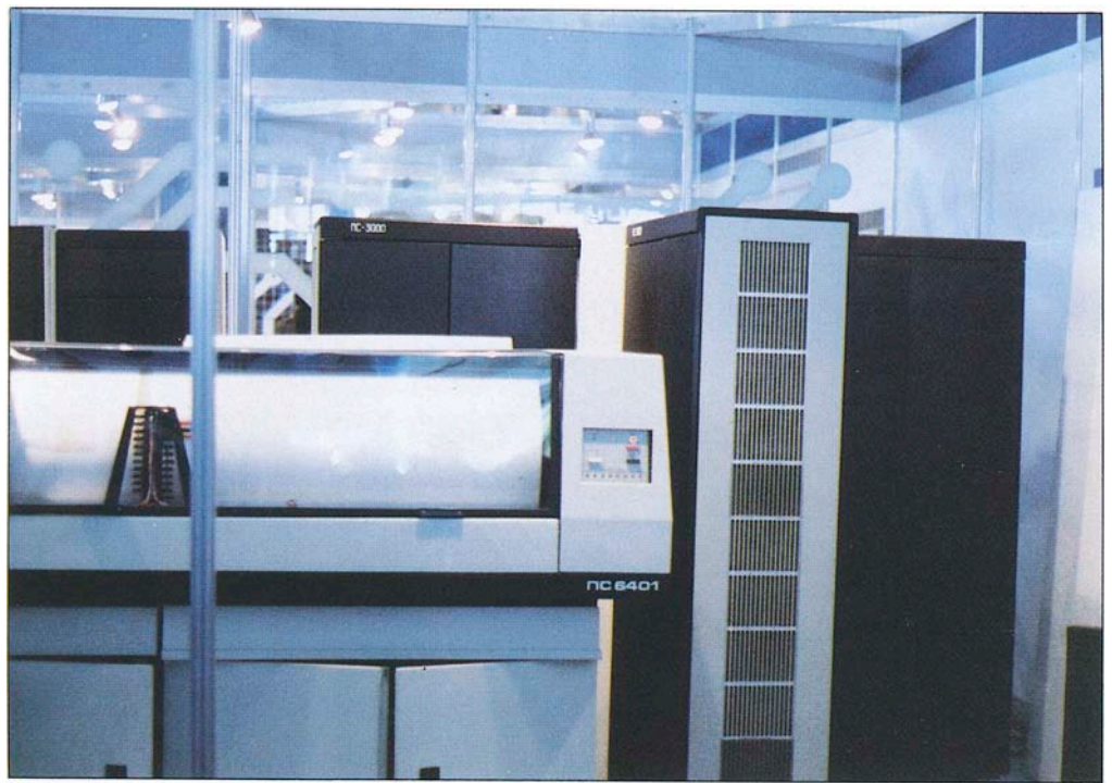
Consisting of a control processor linked with three computational units, the PS-3000 multiprocessor system supports scalar and vector processing as well as interrupt handling.

Most Soviet researchers have not yet begun to take advantage of what is technically possible with professional-level personal computing, let alone networking. It is within Soviet capability to build reasonably modern packet-switched networks, although the absence of economies of scale make it expensive. The telecommunications infrastructure and the installed hardware base is such that it will take major investment and considerable time before widespread access to networking technologies, especially from home computers, becomes a reality. Akademset' will be expanded and elite groups of scientists will be able to use it to carry out important work, but the kind of total interconnectivity which is now enjoyed by U.S. scientists is still well in the future for the Soviet Union. Electronic mail communication will grow much more slowly than it has in the U.S. because of the slower rate of introduction of personal computers, the lower throughput of communications channels, and the traditional isolation of Soviet scientific institutions. Access to remote computing resources will depend at least as much on the establishment of the resources as on networking technologies. Database access will continue to grow and may prove to be one of the most important networking applications in the near term.