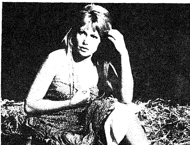
MEANWHILE, back at the ranch . . .