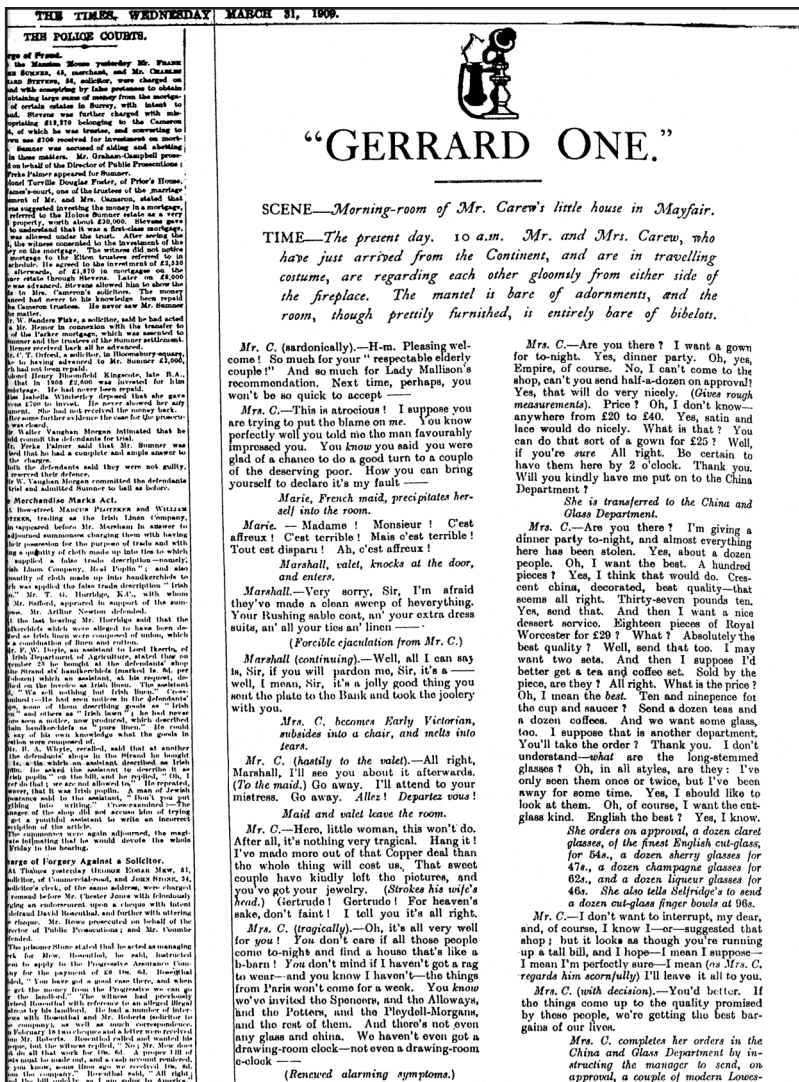
Fig. 3. Selfridges' advertisement, "Gerrard One," Times, March 31, 1909: 4.

surrounded by the suggestion of distinction—the single, beautiful object. As a writer for the Daily Mail noted, “Each window-frame formed a sort of proscenium for a deep-set scene with a painted background in colours delicately harmonizing with the articles occupying what may be termed the centre of the stage. The windows were not crowded with selling articles. No price tickets were displayed.” 23 The commodity was the star in the spotlight. On the other hand, the store's interior also presented models of abundance. While many of the special displays and showcases within the store continued the idea of the transcendent commodity appearing outside, the sheer number of goods suggested plenty over particularity and exclusivity. 24 As one contemporary reviewer commented, on opening day, visitors could find “large quantities of woollens,” “about 1000 washing robes,” “Dress materials too numerous to be mentioned” and thousands of