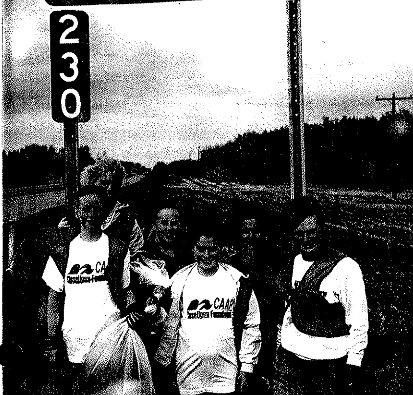
LEFT: Participants in the Civic Achievement Award Program (CAAP) take a break from cleaning up alongside a highway in Wadena, Minnesota.