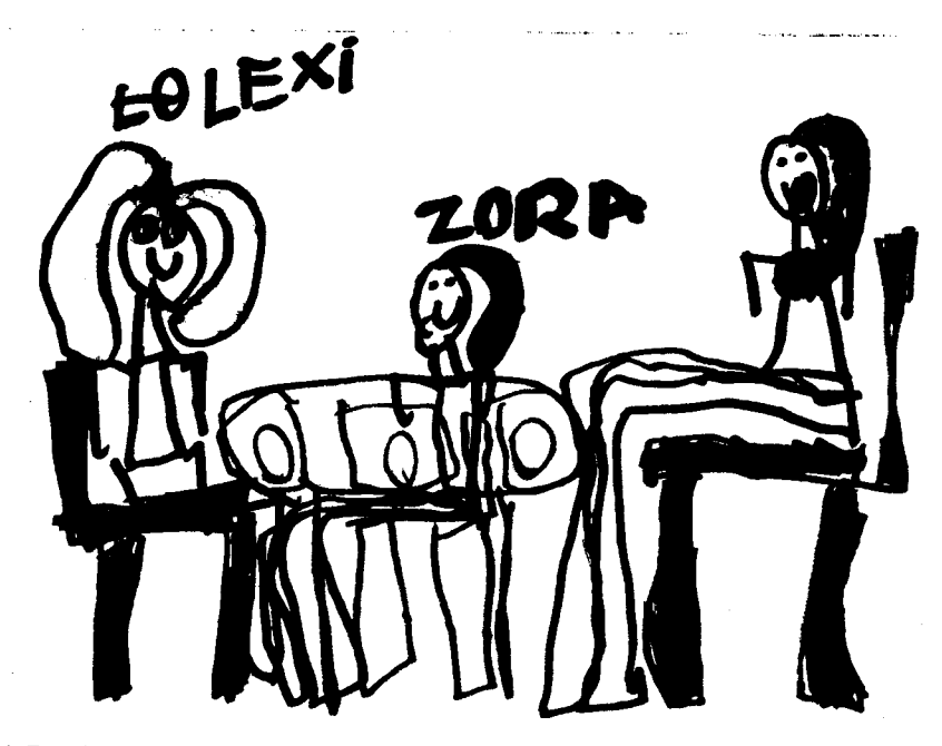
Illustration 1. Zora drew a picture of lunch time at the Senior Center. Her caption reads "Senior Center."

see how some children easily read the books to their new-found friends; others recited their books from memory, getting most of the words right; some "read" the pictures; and still others relied on adults to read the books to them. (Pictures 1 and 2)