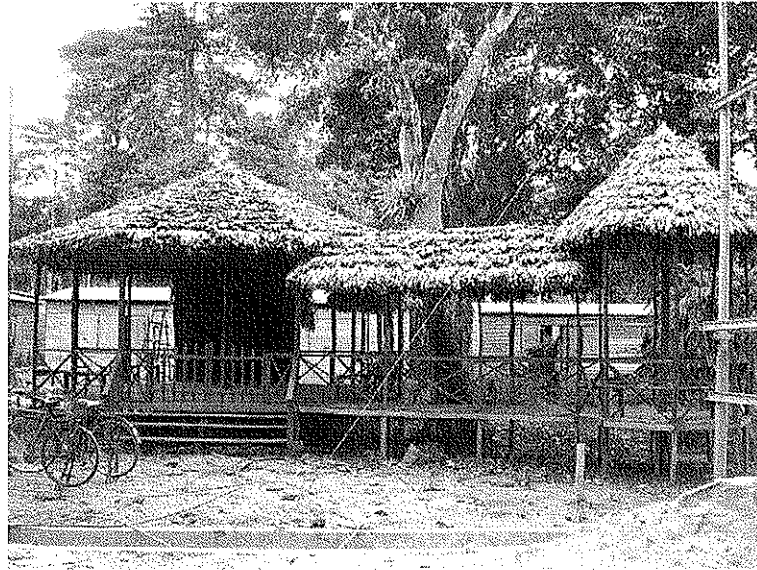
FIGURE 3 COMMUNITY CENTER IN HUTBAY, LITTLE ANDAMAN ISLAND.

Interns are required to complete individual reports documenting and critically analyzing the work completed during the internship. The reports are an invaluable opportunity for interns to reflect on their experiences and are archived by ESW-Stanford to ensure transfer of knowledge. To ensure completion of the report, the report, along with supplementary documents and relevant paperwork, must be submitted to ESW-Stanford prior to receiving the final reimbursement for living expenses during the internship.