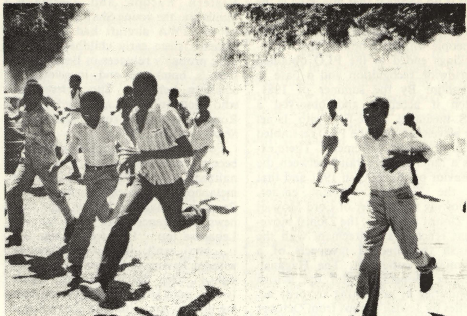
U.S.-supplied tear gas used against protesters in front of National Palace (February 18, 1986).

Yet while excitement about this new vehicle for national and community information and education is strong, the government has taken steps to block the free press. Journalists have been harassed and arrested on several occasions. And in August the interim