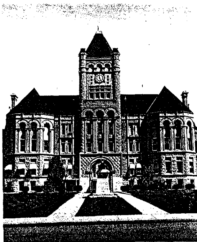
Gage County Courthouse, in downtown Beatrice

Beatrice is the county seat of Gage County, in southeastern Nebraska. Its 1980 population of 12,891 represented a 4 percent increase in ten years—a slightly higher growth rate than the previous decade, but lower than the growth rate for the state as a