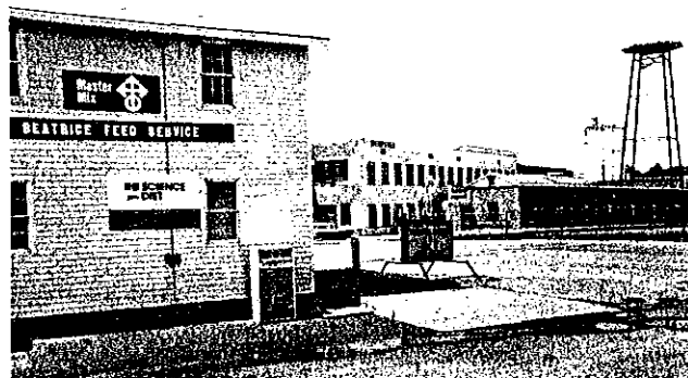
Agriculture supports several small businesses in Beatrice