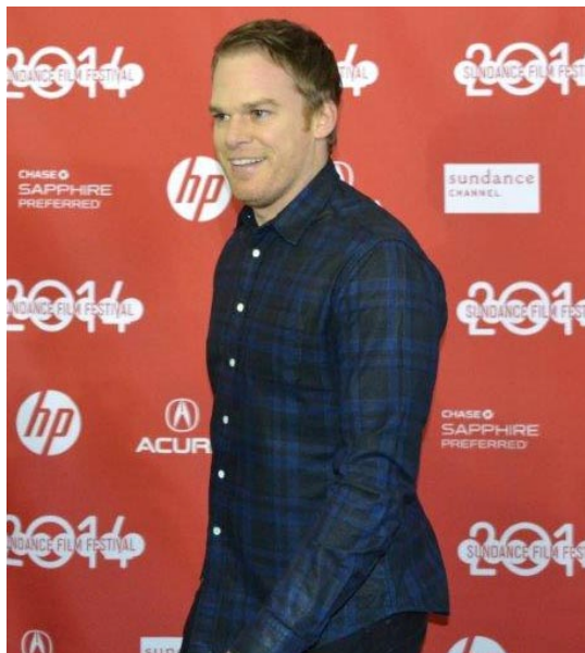
Michael C. Hall