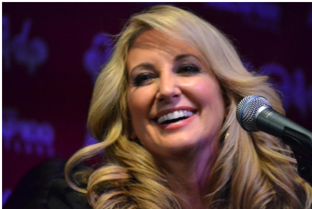
Lee Ann Womack sang at the ASCAP Music Café on Main Street at Sundance. (above).