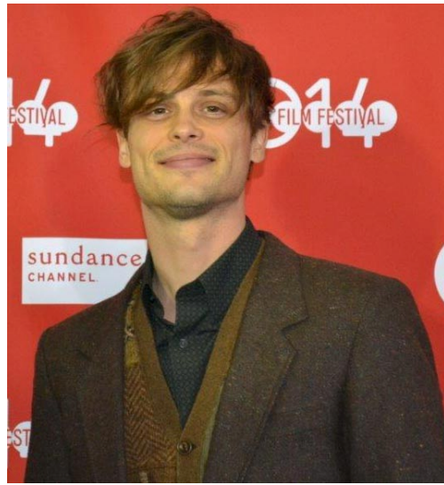
Matthew Gray Gubler