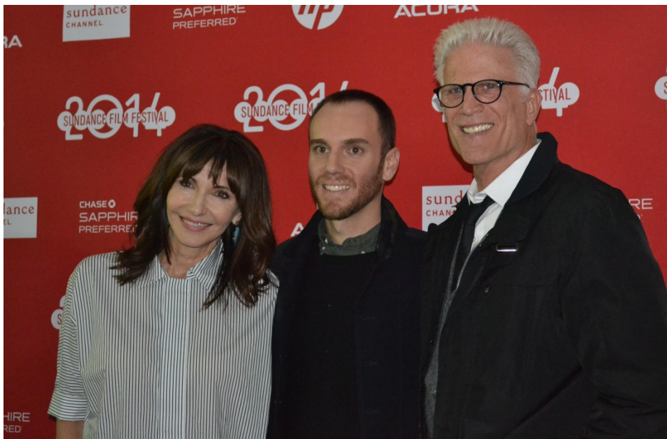
Mary Steenburgen, Charlie McDowell, Ted Danson