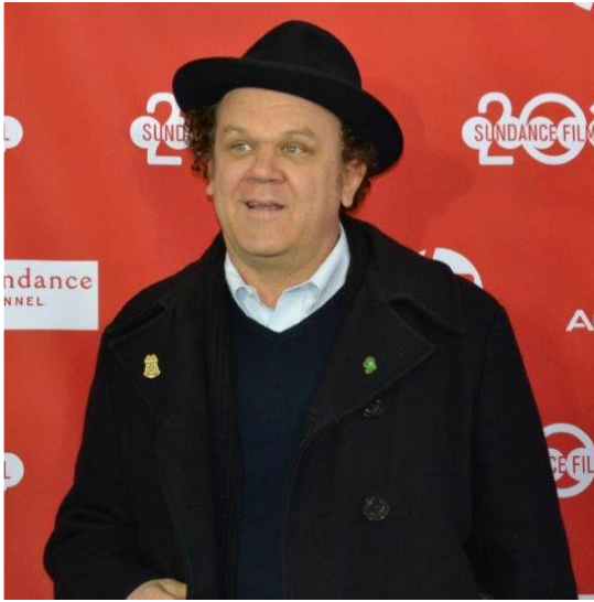
John C. Reilly