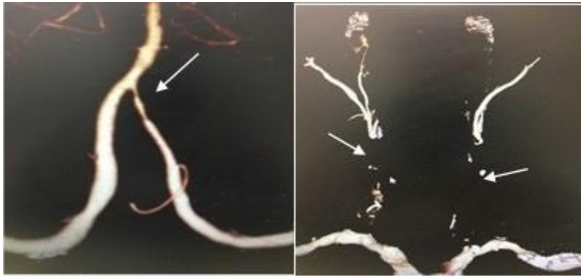
Figure 1: CT angiography showing stenosis of left vertebral artery (left) and occlusion of bilateral common carotid arteries (right)

CT perfusion scanners revealed hypoperfusion of both anterior MCA and ACA territories with completed infarct in the left anterior frontal lobe (Figure 2).