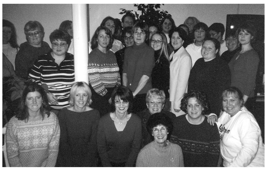
Some of the ATC Staff (December 2003)