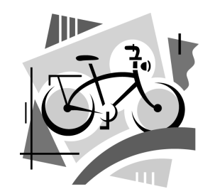
First Annual Bicycle Ride for Autism Awareness

Another consideration when selecting a voca as an augmentative communication system is "who will be trained to program the device?" There need to be a number of individuals in each environment who know how to program the device. A few years back, I consulted with a young man who had cerebral palsy. This young man used a Delta-talker to communicate. At least every 2 months I'd get a call from the sheltered workshop informing me of a problem with the device and could I please come and re-program it. There was more than one occasion where I was not able to get to the sheltered workshop for 2 weeks at the very earliest. This was particularly terrible because due to severe mobility restrictions, an inexpensive back-up system was not an option for this man and the family couldn't afford a second device. As a result, the individual was without a means to communicate until I could get to the workshop. My personal recommendation is