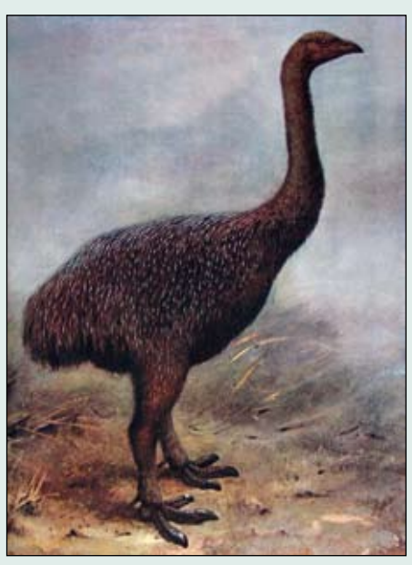
GREATER BROAD-BILLED MOA

This exhibition only represents a quick survey of a big subject. Unfortunately, there are just too many extinct birds to aim at comprehensive coverage, except for the North American continent. Furthermore, the show focuses on bird extinctions from ca. 1600, when birds began to be recorded systematically. The exhibition is arranged geographically, beginning in Madagascar and moving east through the