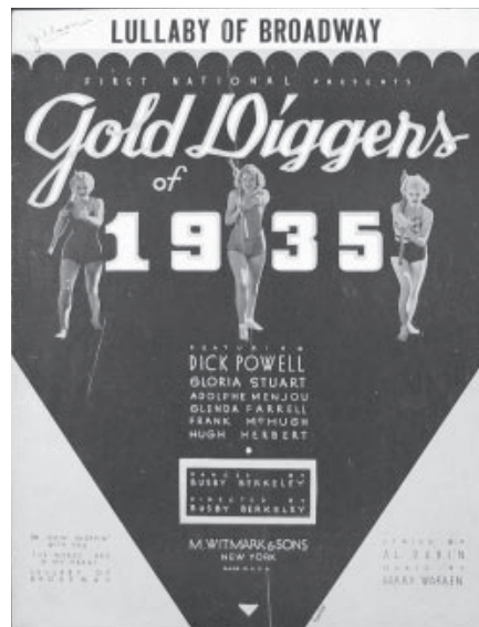
Lullaby of Broadway (1935)

way (1935); You Must Have Been a Beautiful Baby (1938) with lyrics by Johnny Mercer for the Warner Brothers production Hard to Get ; and On the Atchison, Topeka and the Santa Fe (1945) with Johnny Mercer's lyrics for the MGM film The Harvey Girls starring Judy Garland. On the Atchison, Topeka and the Santa Fe is the feature song. The recording was made in 1945 on the Capitol label by Paul Weston and his orchestra, featuring Johnny Mercer as vocalist backed by the Pied Pipers (Gunshanan Collection).