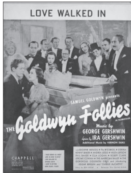
Love Walked in (1938)

Additional songs by Gershwin include: the feature song, Embraceable You (1930); Boy What Love Has Done for Me (1930); Summertime (1935) from Porgy and Bess ; They Can't Take That Away From Me (1937); and Love Walked In (1938). The recording of Embraceable You was made by Nat King Cole in Los Angeles, circa 1944, for Capitol Records (Gunshanan Collection).