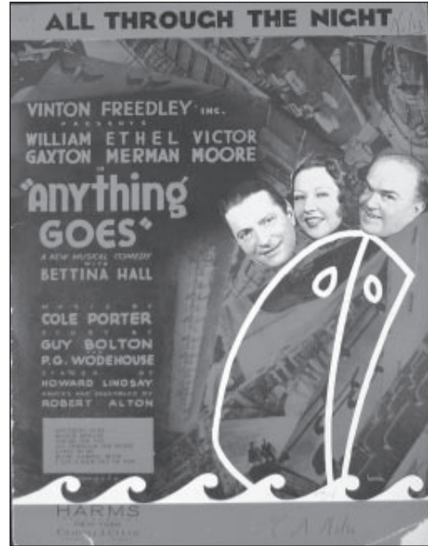
All Through the Night (1934)

Another cover displayed is for All Through the Night (1934), also from Anything Goes . The cover depicts Ethel Merman in company with her co-stars William Gaxton and Victor Moore (Niles Collection). Other covers are for Miss Otis Regrets She's Unable to Lunch Today (1934), Ev'rything I Love (1941), and Don't Fence Me In (1941), the latter as included in the Warner Brothers film Hollywood Canteen (1944). The song was popularized on the screen and in recordings by Roy Rogers, Kate Smith, and Bing Crosby