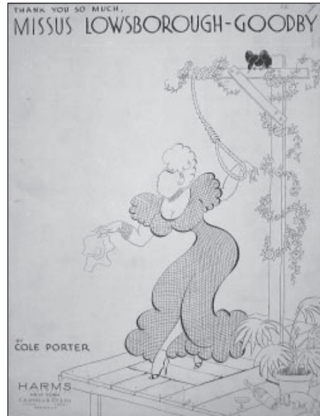
Missus Lowsborough-Goodby (1934)

Shown are a photograph of Cole Porter and the illustrated cover and music for I've a Shooting Box in Scotland (1916) with lyrics by T. Lawrason Riggs