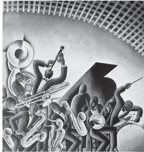
Blues: an anthology (1926)