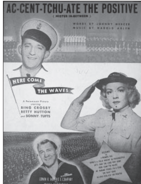
Ac-cent-tchu-ate the Positive (1944)

Arlen composed Stormy Weather , which the music describes as a "slow lament", for the 1933 Cotton Club Parade starring Ethel Waters and George Dewey Washington. The production featured Duke Ellington and his orchestra then in residence at the Cotton Club. The lyrics were by Ted Koehler. Other lyricists