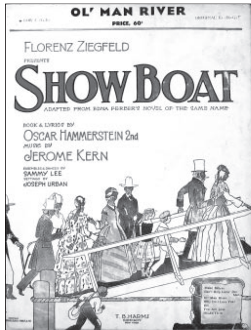
Ol' Man River (1927)

Best known for his Broadway musical Showboat (1927) and its memorable songs including Ol' Man River , Make Believe , Bill , and Why Do I Love You? , Jerome Kern (1885-1945) composed for stage and screen in a career that began during World War I. He collaborated with Oscar Hammerstein 2nd and Guy Bolton as well as with other lyricists including Buddy de Sylva, Otto Harbach, Dorothy Fields, and Johnny Mercer. Shown are the illustrated covers for Look for the Silver Lining (1920), Ol' Man River (1927), Smoke Gets in Your Eyes (the feature song from the 1933 show and subsequent motion picture Roberta ), Lovely to Look At (1935), All the Things You Are (1939), and You Were Never Lovelier (1942). The illustration of Kern is taken from the back cover of Lovely to Look At . The recording of Smoke Gets in Your Eyes was made on June 4, 1941 by Benny Goodman and his orchestra for Columbia Records and featured Helen Forrest as vocalist (Gunshanan Collection).