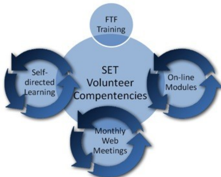
Figure 1. 4-H SET Volunteer Competencies Training Model

The new model includes face-to-face (FTF) trainings that are still relatively short in duration. In addition, however, volunteers can access on-line training modules that deal with specific topics, with the idea that they could view these modules as they prepare for their club meetings. Volunteers can also attend monthly Web-based synchronous Adobe Connect trainings, where they learn from other volunteers and project staff. Finally, volunteers are encouraged to engage in continuous self-directed learning. The Venn diagram below contains four training methods; the circular arrows represent continuous training efforts.