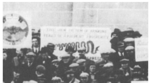
FIG. 5. A close-up of the scene, showing the lettering on the rattlesnake placard.

It has become a cliché to say that New Deal programs ultimately destroyed the appeal of the 1930s era farm insurgency. In November of