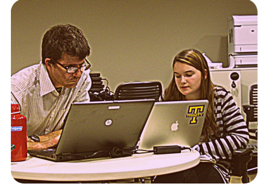
with a presentation of our resources and services to students in Providing help at a Drop-In Research Break

The Library's involvement began during Orientation Week, with a presentation of our re-