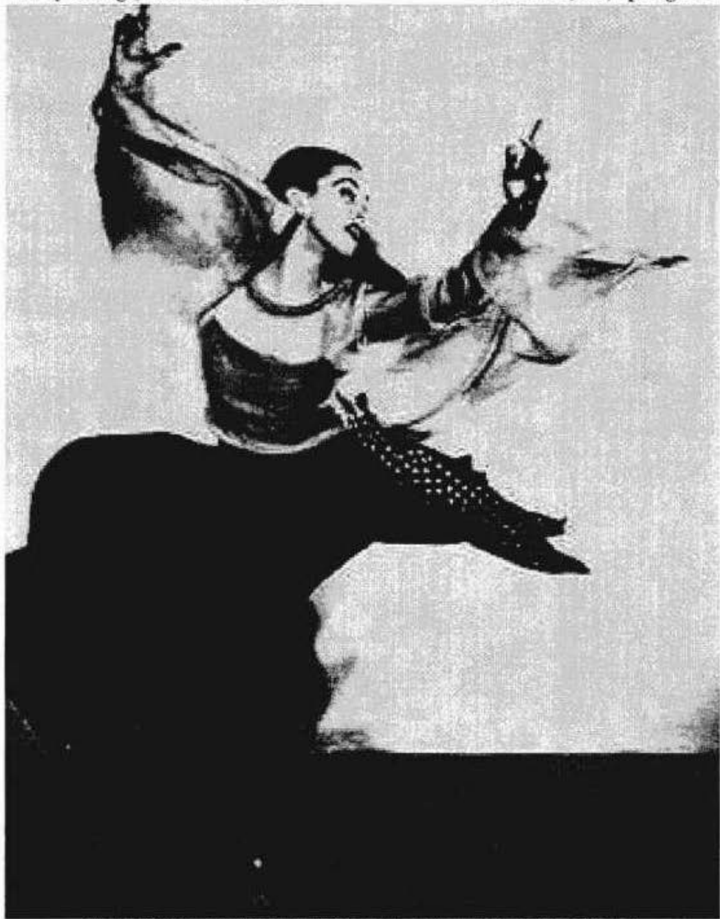
Martha Graham Harlequinade 1930 (solo)