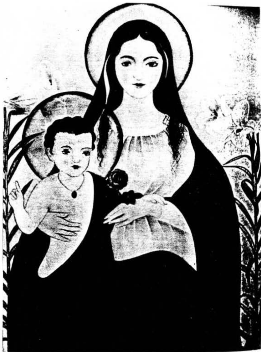
THE MADONNA OF THE ROSE—OKAYAMA