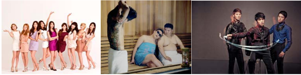
Girls Generation press shot, screenshot from “Gangnam Style” with Psy center, JYJ press shot