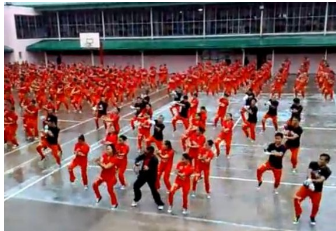
Screenshot from CPDRC reperformance of Gangnam Style

and the idea of the title, turning it instead to read “I’m Yushin Style,” in reference to the Yushin Constitution established in the elder Park’s rule. The message seems to be critiquing the ROK for their hypocrisy in criticizing the DPRK’s ruling tactics and perhaps also an attempt to desituate Park Geun-hye’s legitimacy. Also through the cartoon of Psy’s body, the video attempts to leverage a criticism of the celebration of absurdity in “Gangnam Style” while also mobilizing the popularity for political ends. In both critiques, the origins of economic wealth are questioned with political inquiry. Psy questions class expression while the propaganda video points to economic growth as an outcome of authoritarian politics. What is important to draw out in this digitized collage is that the political nature of the video resonates with but does not replicate a critique of Korean opulence; YouTube thus becomes a site for political engagement between estranged interlocutors. It engages in a similar mode of critique but instead of being targeted at capitalism, it flips the labeling of authoritarian regimes from North to South. Whereas the DPRK’s video rendition of I’m Yushin Style! functions in an explicitly political fashion, the next performance of imprisoned bodies in the Philippines realigns with the original in making an explicitly political message obliquely.