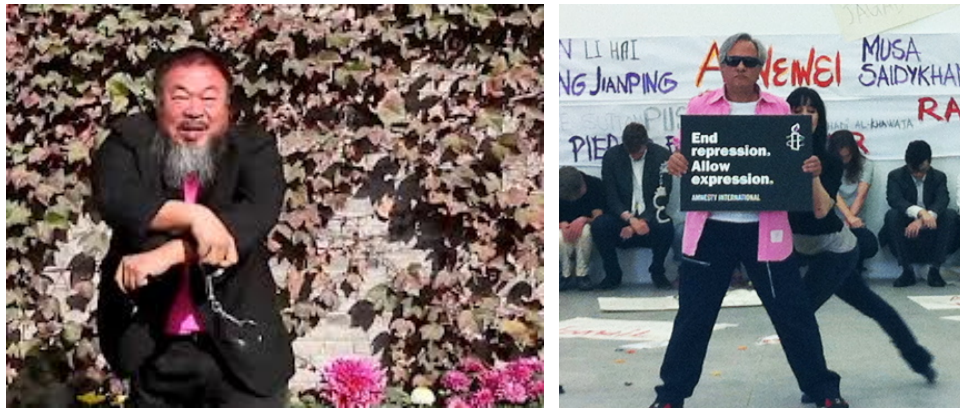
Screenshots from Ai Wei Wei reperformance and Anish Kapoor reperformance

Ai Wei Wei is a Chinese dissident who was jailed by the People's Republic of China (PRC) and has since been released. His video reperformance is a very jovial sketch of friends dancing to the music of "Gangnam Style" employing some of the signature moves, spliced with images from the original music video. 15 In some of the scenes Ai Wei Wei holds handcuffs and lassos them above his head, which led to the video being scrubbed by censors from several Chinese websites the day after posting (Beijing AP 2012). His reperformance then led to British activist artist, Anish Kapoor, to create a video homage to Ai Wei Wei's reperformance, making explicit political statements and directing viewers to letter writing campaigns to demand the release of imprisoned Chinese dissidents as well as promote freedom of expression and voice to those in the Americas.