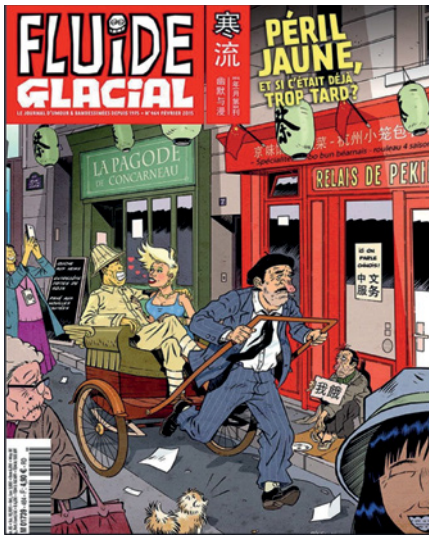
Figure 2: A French Cartoon on Chinese in Paris