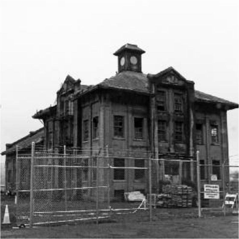
CITY OF INDUSTRY: PORTLAND GASCO BUILDING BY HARRY BLAKEMAN