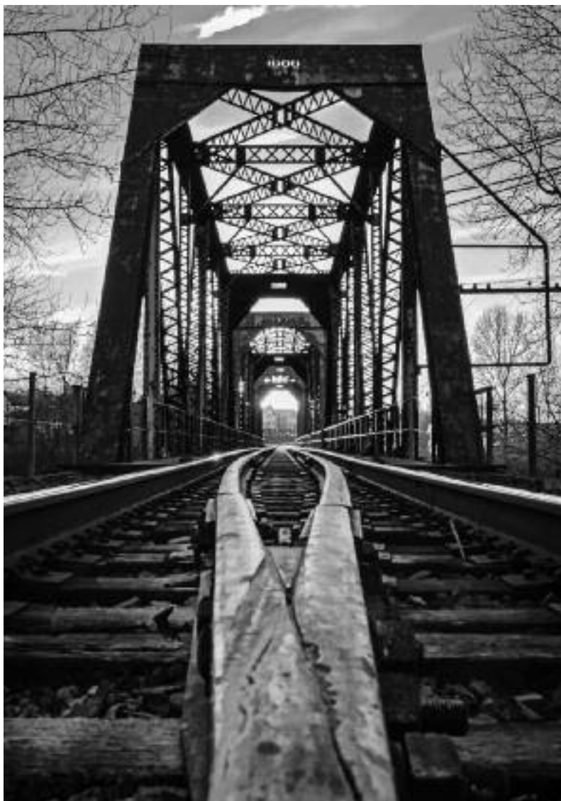
RUSTIC SUNSET BY MATT KLEMSZ