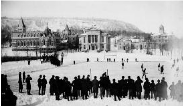
Figure 1: Hockey at the Montreal Winter Carnival 1884

Playing hockey on the skating rink, McGill University, 1884 / Montreal, Quebec.