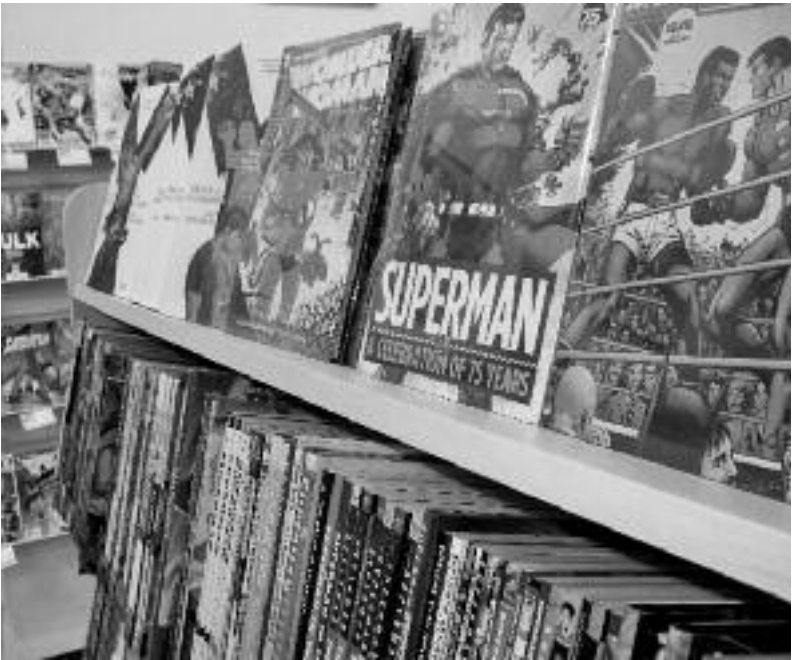
MISSISSIPPI HEROES BY SIERRA HUITT