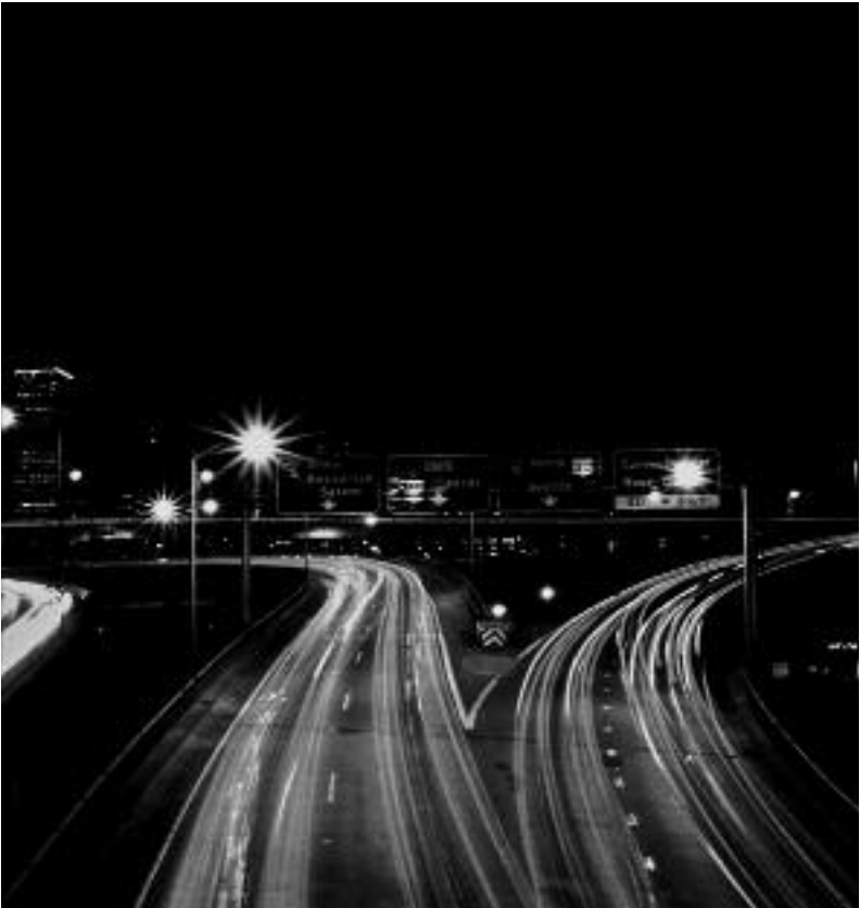
GRAND AT NIGHT BY MATT KLEMSZ