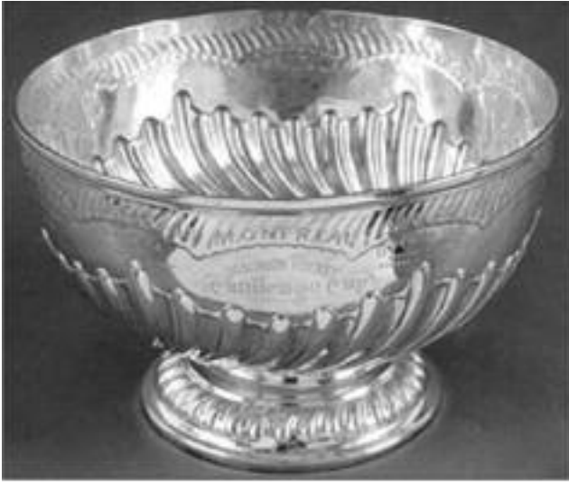
Figure 4: The Original Stanley Cup

Found at the Hockey Hall of Fame's Page, the Stanley Cup Journal: [ http://www.hhof.com/htmlSTCjournal/exSCJ08_38.shtml ]