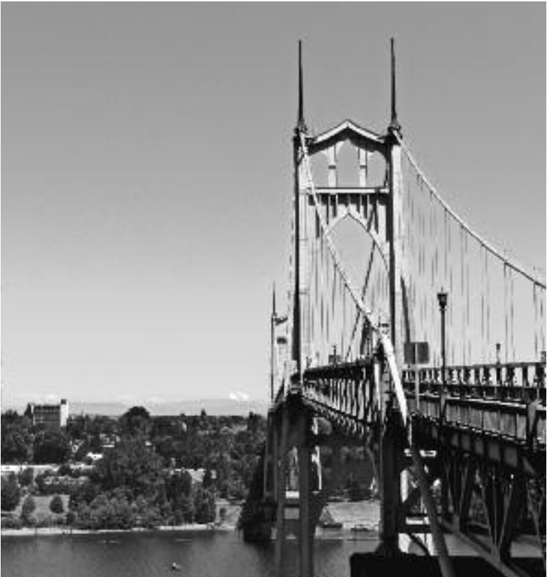
STANDING GIANT BY MATT KLEMSZ