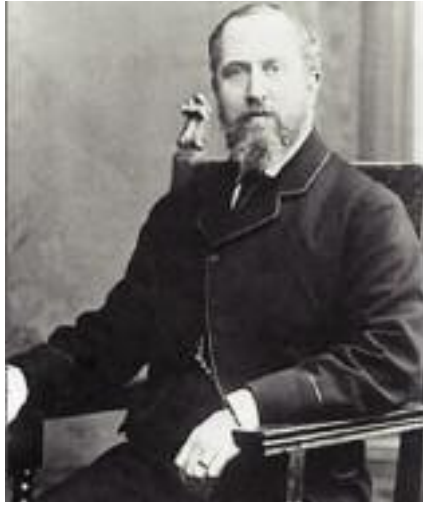
Figure 2: Lord Stanley of Preston, Earl of Derby