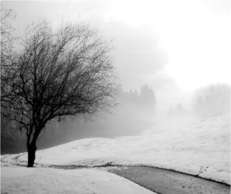
A WINTER WALK BY KARRIE HOAG