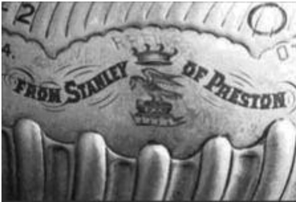
Figure 3: Stanley's Inscription on the original Dominion Challenge Trophy

Found at the Hockey Hall of Fame's page The Stanley Cup Journal: [ http://www.hhof.com/htmlSTCjournal/exSCJ08_38.shtml ]