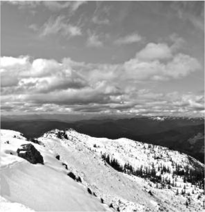
SNOW ON SILVER STAR BY MATT KLEMSZ