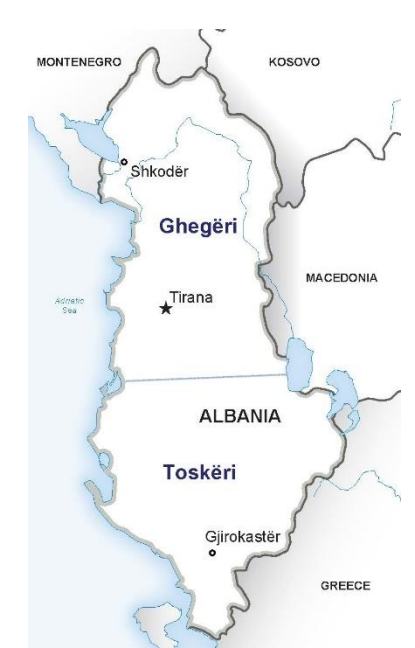
Figure 1. Map of Albania (Onestopmap, 2018).

musical diversity. Tirana, the capital, has its own style of urban music, while the music of the north and that of the south use completely different instruments, number of melodies, modal/tonal systems, and musical genres (Shetuni, 2011). To showcase the musical life in those distinct areas, I have identified several cities which offer benefits to students of music and culture. Tirana, as the largest city and capital, offers a base with many resources from which to learn about Albanian history and urban music. Gjirokastër, in Toskëri (the south), is the site of the national folklore festival which takes place every five years. And