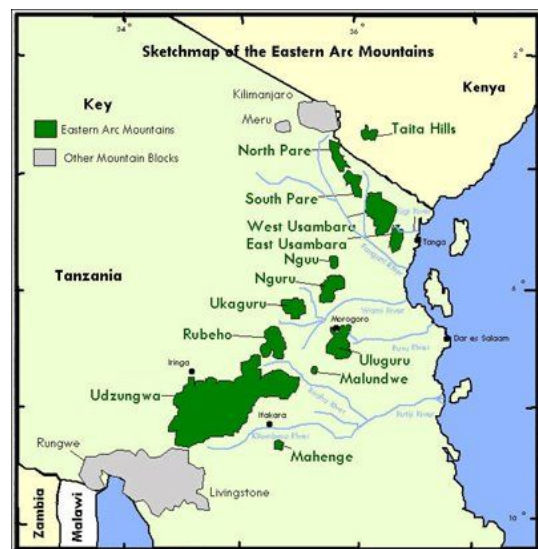
Map 1. The Eastern Arc Mountains of Tanzania, which include the West Usambara Mountains, where Mazumbai is located. (UAMCEF)

The livelihoods of the people of Mazumbai are closely connected to the land on which they live, the area, and the climate of the region. Mazumbai is located in the northeast corner of Tanzania in the West Usambara Mountains, part of a larger range of mountains called the Eastern Arc Mountains (Map 1). This belt of mountains spans eastern Tanzania up to the border with Kenya. Temperatures are lower and precipitation rates are higher than in surrounding areas. Like the rest of the country, precipitation patterns are bimodal, with